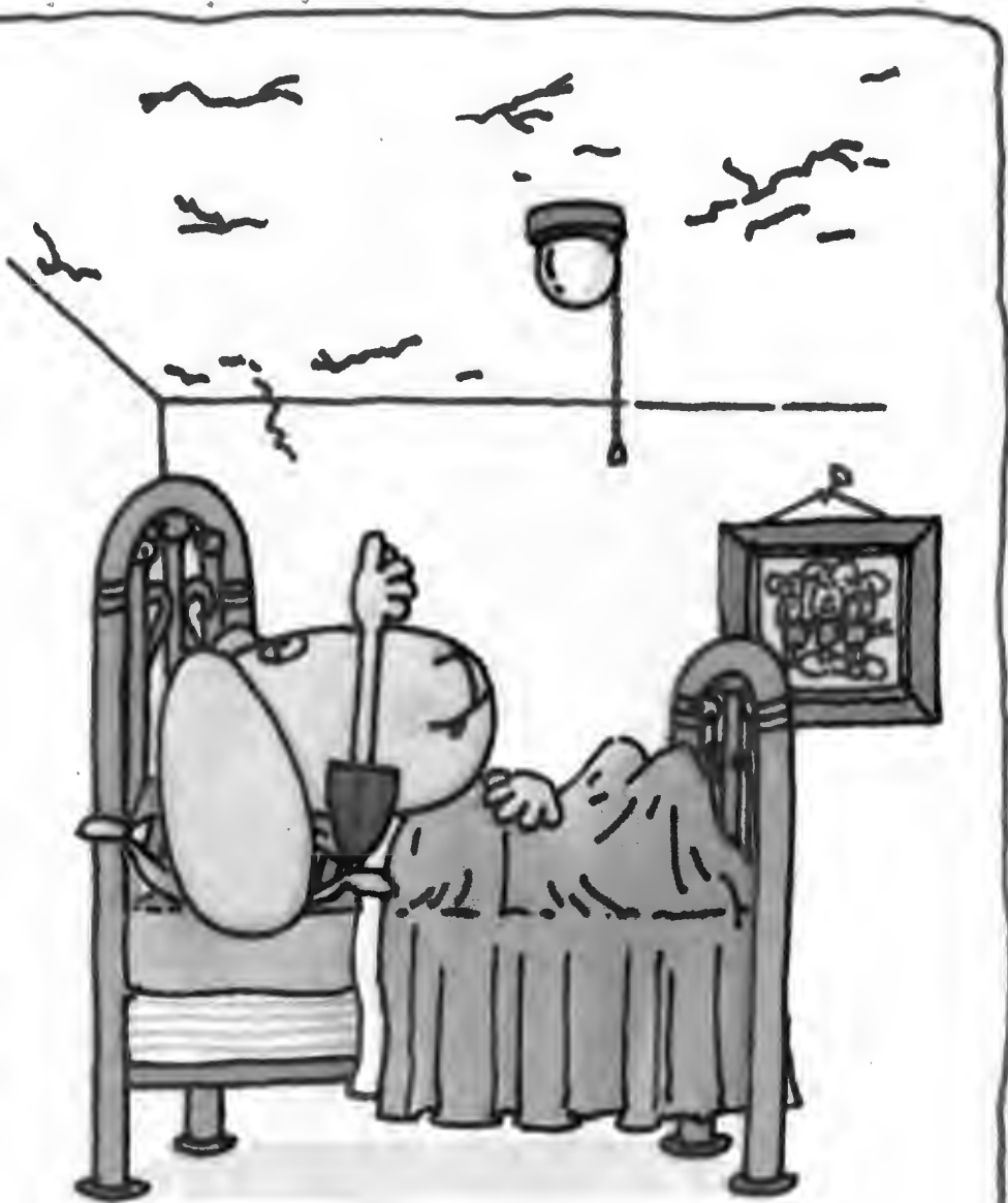
COUNTING CRACKS upon the ceiling;