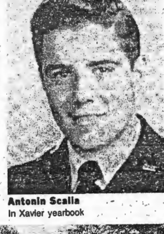
Antonin Scalia In Xavier yearbook