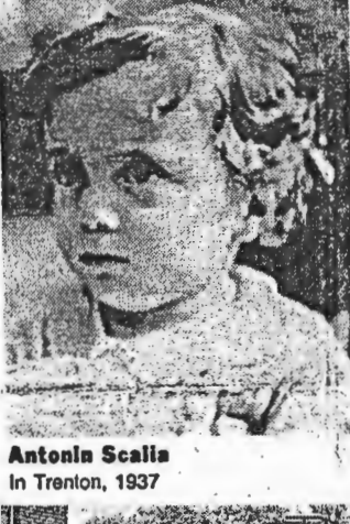
Antonin Scalia In Trenton, 1937