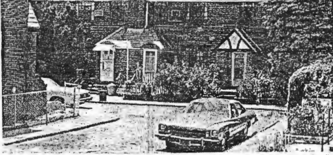
HOME IN QUEENS: 48-22 O'Connell Court, Elmhurst, Queens, where Scalia lived in the 1940s.

A list of a dozen names or so, for both the chief justice and justice nominations, was said to include only sitting judges, which would have ruled out Attorney General Edwin Meese, FBI Director William Webster, a former federal appeals court judge, and William Clark, the Reagan buddy who is a former interior secretary and California Supreme Court justice.