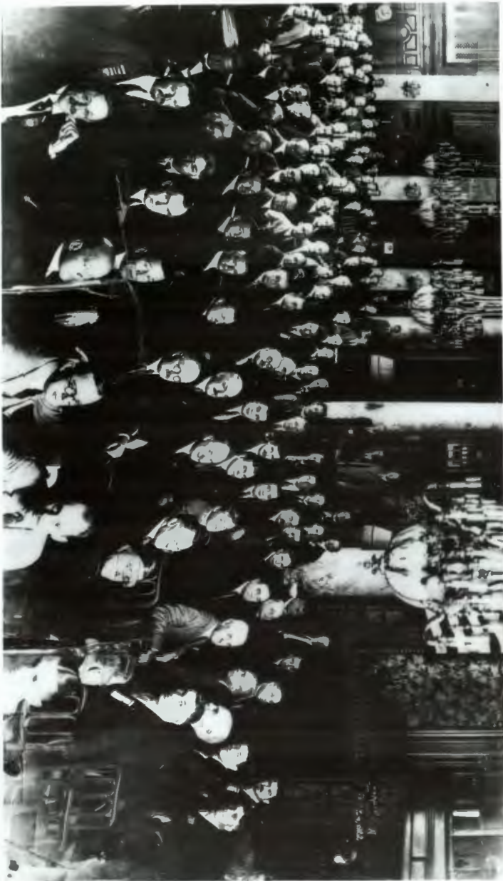
The first National Convention of ROA in the Willard Hotel, Washington, D.C. October 2-4, 1922. The opening session was addressed by General of the Armies John J. Pershing, shown standing behind the desk, top center.