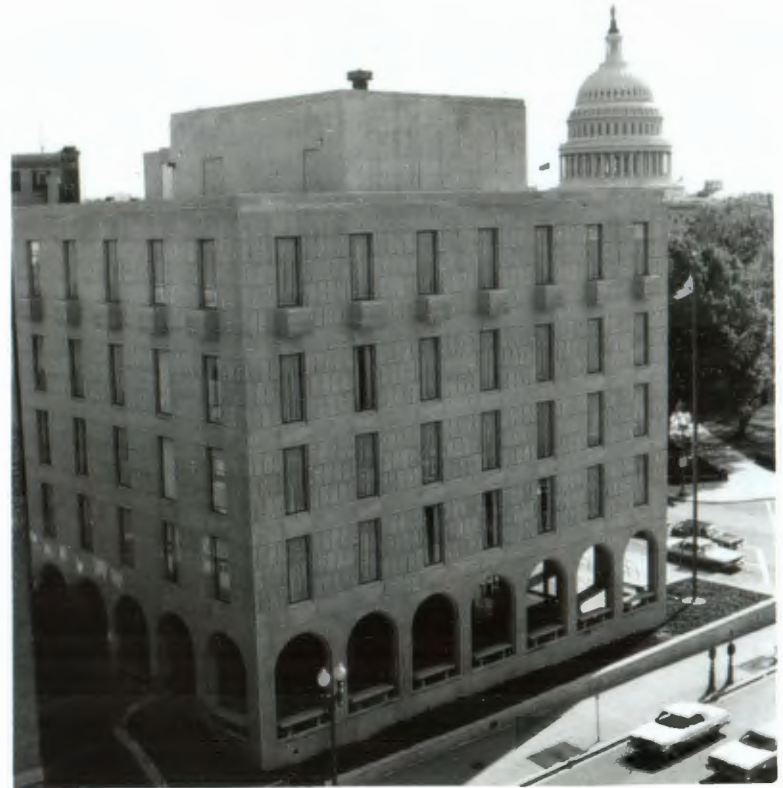
The Minute Man Memorial Building, across from the U.S. Capitol in Washington, D.C., is the headquarters of the Reserve Officers Association of the United States. The five-story building was dedicated in 1968. It was built at the cost of almost $1.5 million and, due to the generosity of the members in a fund drive chaired by General Lewis B. Hershey, is mortgage-free.