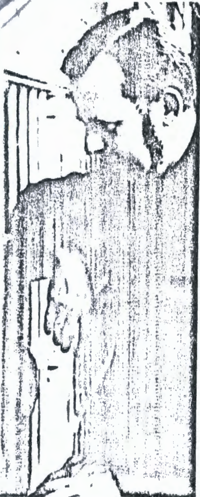
here represents one kind of prison are also working together to provide services to inmates and their families.