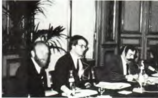
Paris: Christopher ...ndhat, Vice President, ...mission of the ...ean Communities