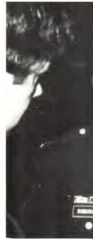
Brussels: General Secretary of the European Commission