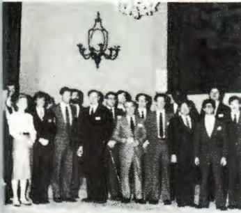
Paris: Exchange XIII Executives in Paris