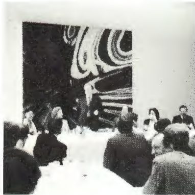
Brussels: General Secretary of the European Commission