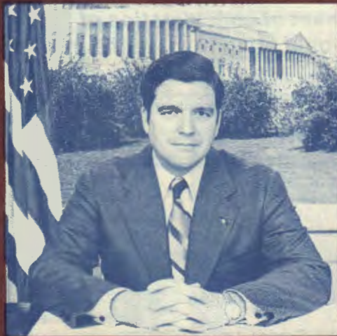
Dr. Lawrence Patton McDonald, M.C. April 1, 1935 - September 1, 1983

"... Congressman Lawrence P. McDonald (D-GA) was a friend of NASC and of all people who love freedom."