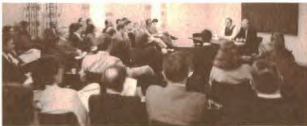
Richard Allen, National Security Advisor to the President, addresses a meeting of the Stanton Group.

Time magazine has called him the New Right's leading strategist; his advice is often sought by Members of Congress and other key opinionmakers. He has also helped found a number of key groups which are implementing conservative policies, including the Senate Steering Committee, the House Republican Study Committee and the American Legislative Exchange Council.