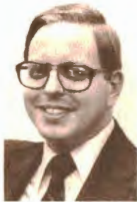
Paul M. Weyrich

The chairman of the Stanton meetings is Paul M. Weyrich, who is also President of Coalitions for America. A former print and broadcast journalist in Wisconsin and Colorado, Weyrich came to Washington in January, 1967 as an aide to Senator Gordon Allott. He later worked as special assistant to Senator Carl T. Curtis. He was the founder and first President of the Heritage Foundation. Shortly thereafter he established the Committee for the Survival of a Free Congress as well as the Free Congress Foundation.