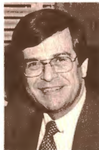
Rep. Trent Lott

During the budget fight in 1981, for example, the Kingston Group played a key role from beginning to end. As the Minority Whip in the House, Rep. Trent Lott, wrote: "I would like to take this opportunity to thank all of the Kingston Group members for your hard work on behalf of the Reagan bi-partisan budget substitute. Your grassroots effort was pivotal in this critical victory.