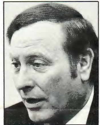
Sen. Charles Mathias (R-Md.) and Sen. Alan Dixon (D-Ill.) are among the guests discussing "PACs: A Change in the Laws?" on BizNet, April 12.