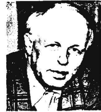
*Andrei Sakharov World Renowned Physicist Peace Nobel Laureate Exiled to Gorki, U.S.S.R.