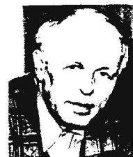
*Andrei Sakharov World Renowned Physicist Peace Nobel Laureate Exiled to Gorki, U.S.S.R.