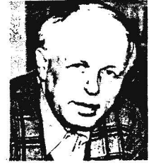
*Andrei Sakharov World Renowned Physicist Peace Nobel Laureate Exiled to Gorki, U.S.S.R.