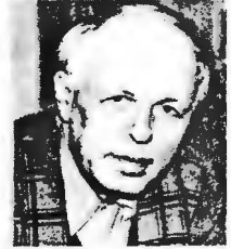
*Andrei Sakharov World Renowned Physicist Peace Nobel Laureate Exiled to Gorki, U.S.S.R.

President Ronald Reagan The White House Washington, D.C.