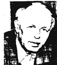
*Andrei Sakharov World Renowned Physicist Peace Nobel Laureate Exiled to Gorki, U.S.S.R.

President Ronald Reagan The White House Washington, D.C.