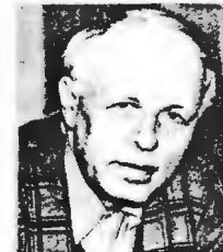
*Andrei Sakharov World Renowned Physicist Peace Nobel Laureate Exiled to Gorki, U.S.S.R.

President Ronald Reagan The White House Washington, D.C.