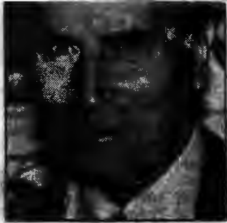
MITTERRAND: Was with French Resistance on D-day

► 282 young U.S. paratroopers float down as part of the