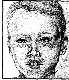
Do You Know Me? Deceased Found December 24, 1985 Hebron, Nebraska