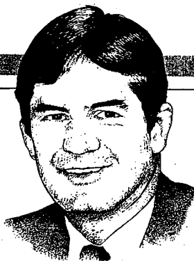
DRAWING BY MARGARET KING

■ Fourth, it is one thing to accept the total vulnerability of one's society, if there is no practical choice; it is quite another to choose to perpetuate that condition, as the inexorable consequence of failing to support a research effort to see if strategic defenses that could provide a useful level of protection are achievable. The Strategic Defense Initiative (SDI) is a moral imperative; the prospects for affordable technical success seem to be high enough that no responsible administration should do other than pay the formidable research and development entry price so the policy debate can pro-