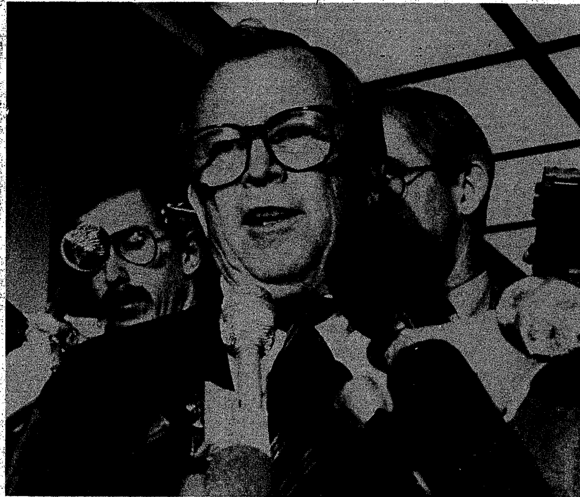
BAKER IN, REGAN OUT — Former U.S. Sen. Howard Baker of Tennessee meets with reporters in Washington Friday after the announcement he will replace Donald Regan as White House chief of staff.

Regan called Baker "a distinguished American" and a man (Please see Baker, page two)