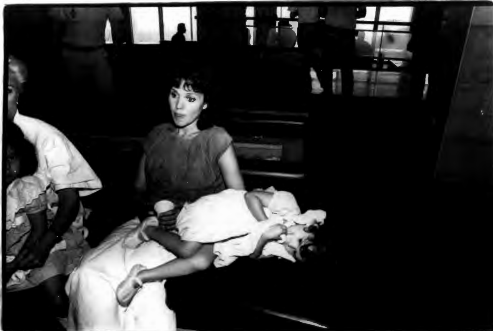
(BEI-6) BEIRUT, LEBANON, JUNE. 14 (AP)—RESTING—A Woman passenger, her daughter lying on the sofa, rest at Beirut airport lounge Friday after being released from the hijacked American Trans World Airlines plane on an Athens-Rome flight and diverted to Bierut Airport. The woman and her child are among 19 passengers rleased here before the plane took off with the remaining 124 passengers to Algeria after refueling.