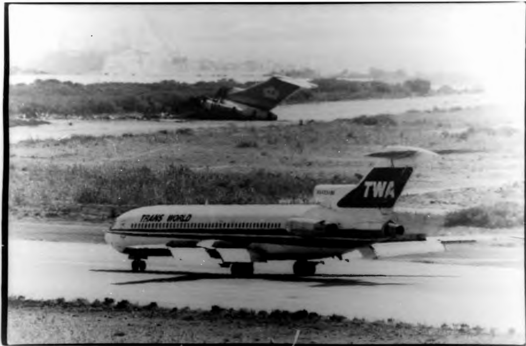
(BEI-1) BEIRUT, LEBANON, JUNE 16 (AP)—THIRD LAND IN THREE DAYS—The hijacked American Trans World jetliner taxis past of the wreckage Royal Jordanian plane after it lands for the third time at Beirut International airport three days Sunday. The Shiite Moslem hijackers renewed their threat to blow it up unless Israeli government freed 50 Shiite Moslem prisoners. (AP WIREPHOTO) (zall322Gut/Merliac/Stf) 1985