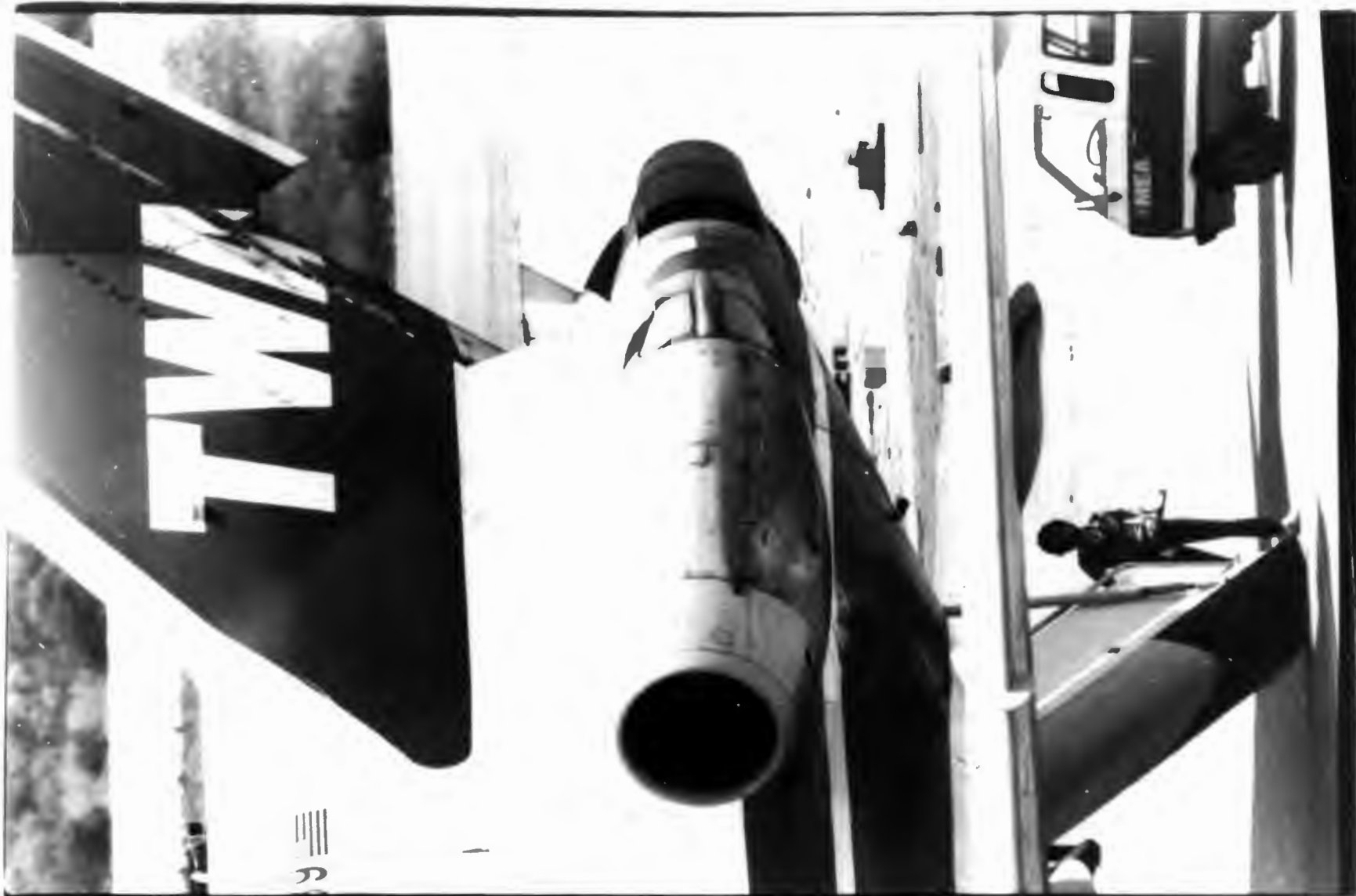
(BEI-6) BEIRUT, LEBANON, JUNE. 18 (AP)—GUARDING THE HIJACKED TWA—A Shiite Moslem militiamen armed with a Soviet-made AK-47 stands at the steps of the American Trans World airlines jetliner at Beirut Airport Tuesday. The TWA plane seized by Shiite Moslem sky pirates on an Athens-Rome flight still in hands of the hijackers.

(AP WIREPHOTO) (zs3155Gmt/Merliac/Stf) 1985