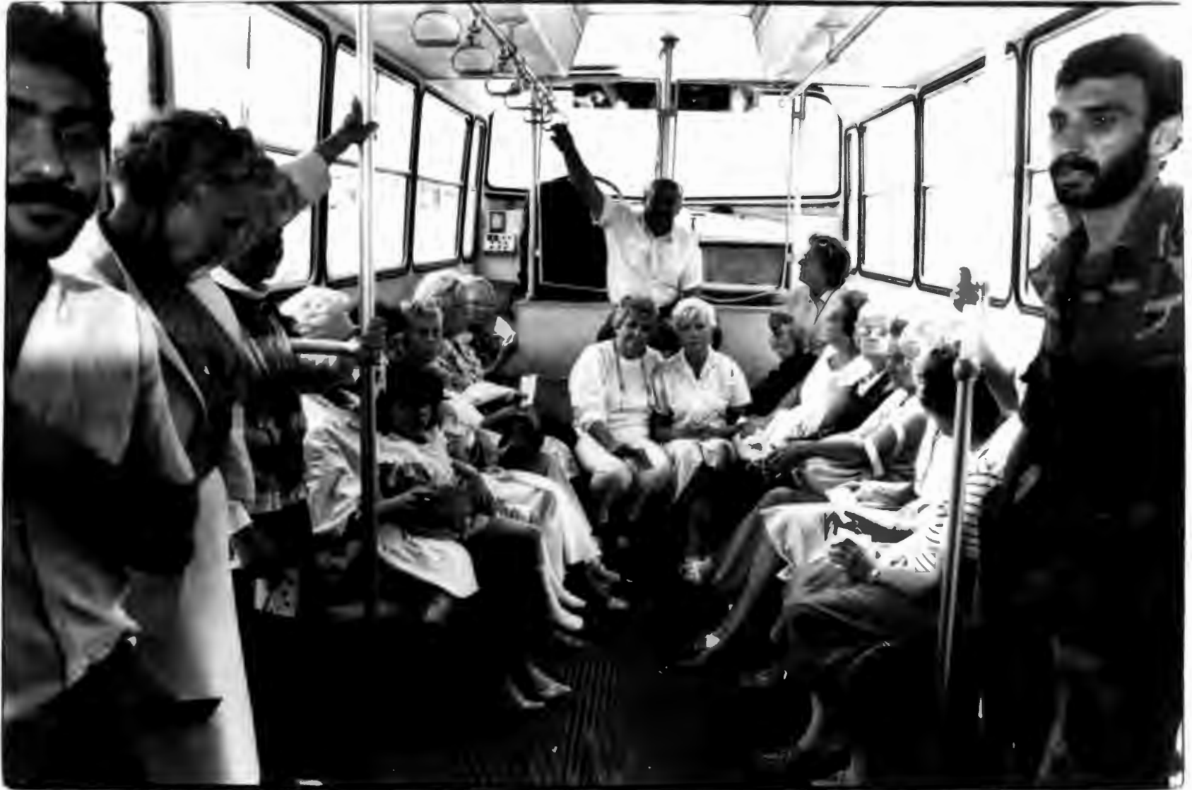
(BEI-9) BEIRUT, LEBANON, JUNE. 14 (AP)—NEW DESTINATION—The released passengers of the American Trans World airlines, escorted by a Lebanese Army soldier, are transported in an airline bus to another plane to fly to a new destination. Cyprus. They are among the 19 women and children freed by the two hijackers of the boeing 727 seized on an Athens-Rome flight and diverted to Beirut Friday. (AP WIREPHOTO) (zs6150Gmt/Asakir/Str) 1985