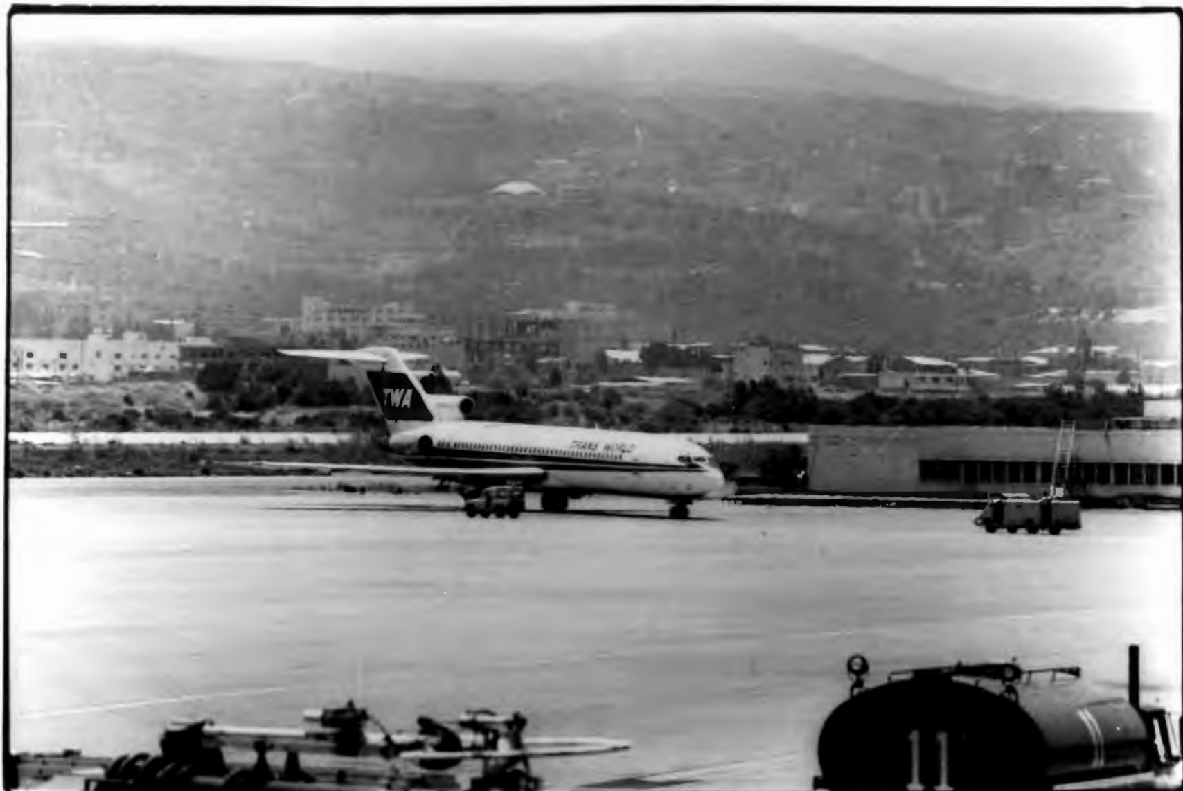
(BEI-1) BEIRUT, LEBANON, JUNE. 14 (AP)—US PLANE HIJACKED—The hijacked US Airlines Boeing 727 plane upon arrival at Beirut Airport Friday with 145 passengers eight crew members on board. The plane, hijacked on an Athens-Rome flight Beirut, refueled and took off to Algeria. (AP WIREPHOTO) (zs1045Gmt/Ammar/Str 1985