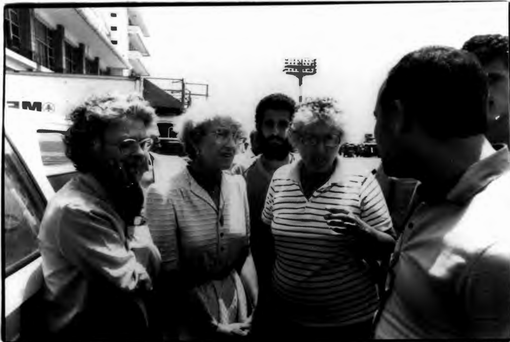
BEIRUT, LEBANON, JUNE. 14—FREED PASSENGERS—Three American passengers talk to airport security an at Beirut Airport after been freed from the US Trans World jetliner hijacked on an Athens-Rome flight and diverted to Beirut with 145 passengers and eight members on board. Friday. 1985