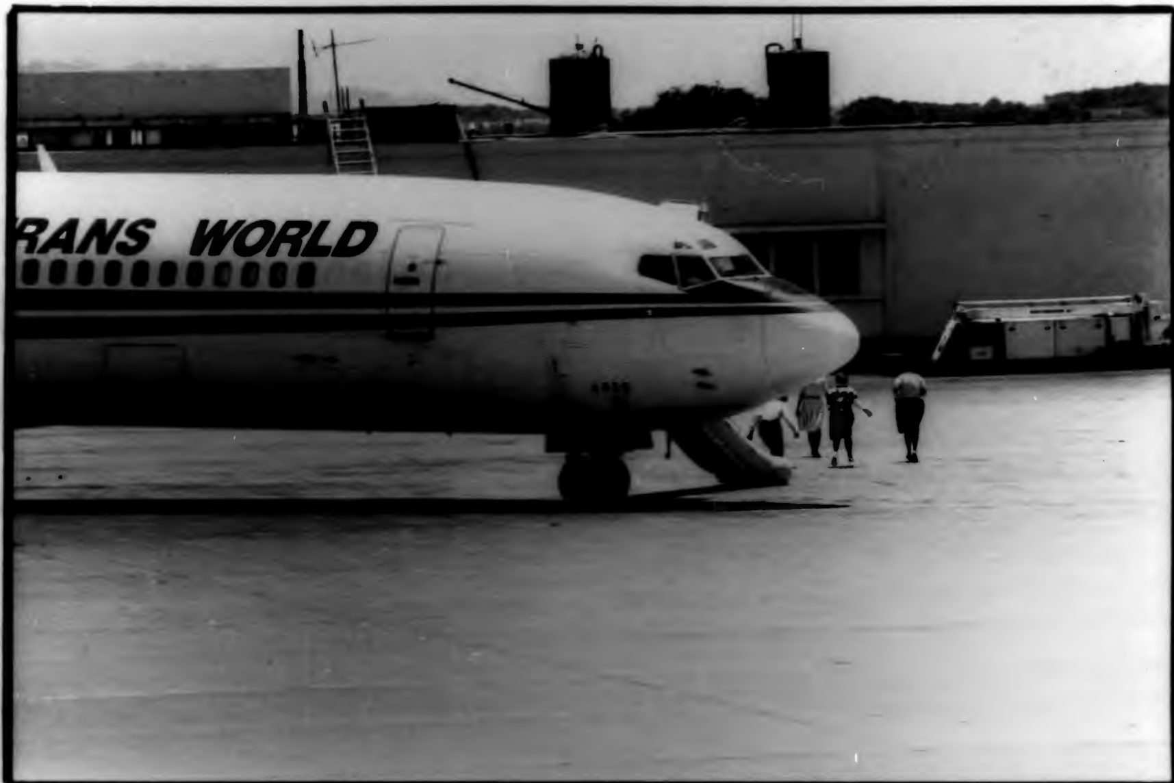
(BEI-10) BEIRUT, LEBANON, JUNE. 14 (AP)—SLIDE DOWN—Some of the 19 freed women and children slide down an escape chute at the front door of the hijacked American Trans world airlines jet at Beirut International Airport Friday. The boeing 727 with 145 passensgers was seized by two hijackers on an Athens-Rome flight and diverted to Beirut. The plane later arrived Algeria airport. 1985