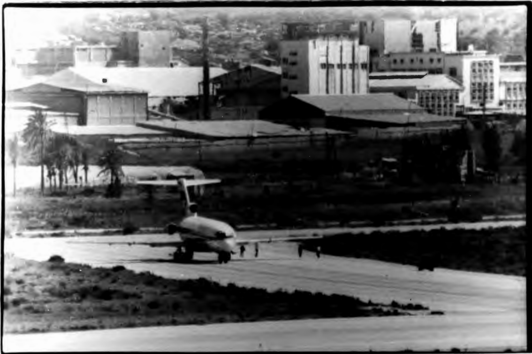
(BEI-4) BEIRUT, LEBANON, JUNE. 16 (AP)—BELIEVED SECURITY—Four Lebanese men believed to be security officers approach the US Trans World plane shortly after landing at Beirut airport Sunday for the third time in three days. The TWA jet was hijacked on a regular Athens-Rome flight last Friday by Shiite Moslem sky pirates. The hijackers renewed their threat to blow up the plane if Israeli government does not free Lebanese Shiite prisoners jailed in Israel. 1985