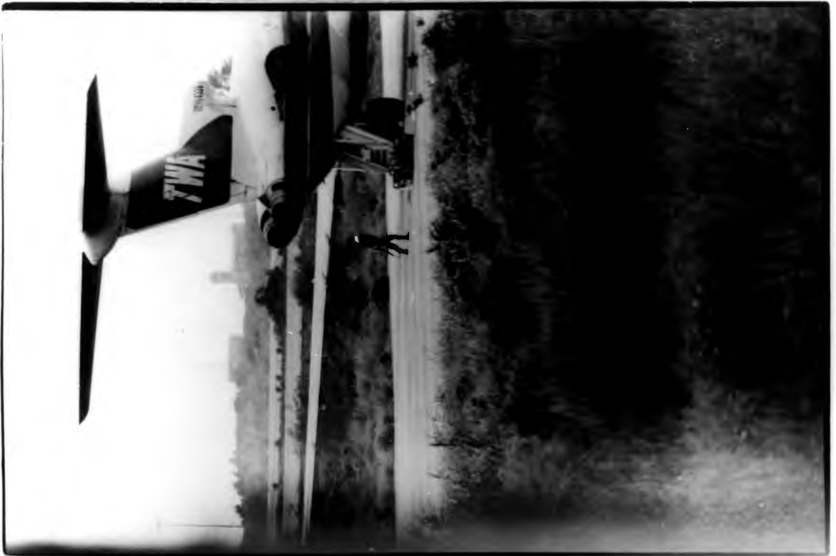
(BEI-6) BEIRUT, LEBANON, JUNE. 16 (AP)--POLICE THE PLANE--An armed hijacker walks outside the hijacked US Trans World jetliner at Beirut International airport Sunday shortly after landing here for the third time in three days. The sky pirate police the plane from any military action against them. 1985