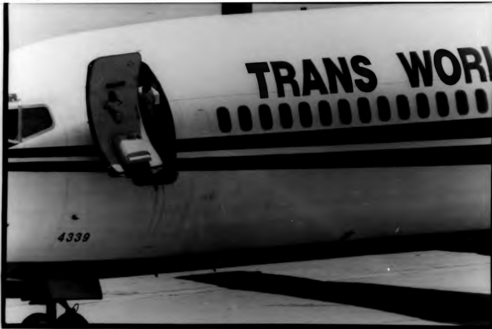
(BEI-6) BEIRUT, LEBANON, JUNE. 19 (AP)—HIJACKERS AT THE PLANE DOOR—A Shiite Moslem hijacker armed with a Soviet-made AK-47 rifle looks out of the door of the hijacked American Trans world airlines jet Wednesday, held at Beirut International Airport since last Sunday. The hijacker wore a white T-shirt with the drawing of the star of David and fist in the middle as a sign of the Shiite struggle against Israel. The plane was hijacked on an Athens-Rome flight last Friday and the sky pirates demanded the release of 700 Shiite Moslem jailed in Israel. (AP WIREPHOTO) (zs415Gmt/Merliac/Stf) 1985