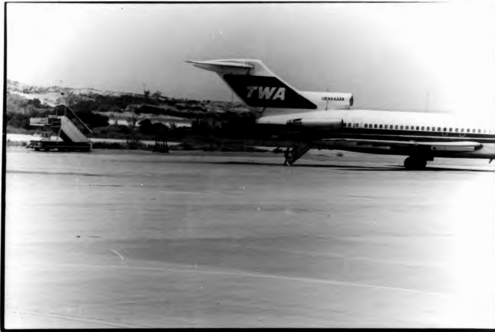
(BEI-3) BEIRUT, LEBANON, JUNE. 17 (AP)—DELIVERING NEWSPAPERS—An Armed militiaman shakes hands with one of the sky pirates of the Trans World airlines jetliner Monday as he delivers newspapers and sandwiches to the 40 mainly American hostages Monday. The hostages have been aboard the white and red boeing 727 since Friday, when the aircraft was hijacked on an Athens-Rome flight. (AP WIREPHOTO) (zs21225Gmt/Saiddi/Str) 1985