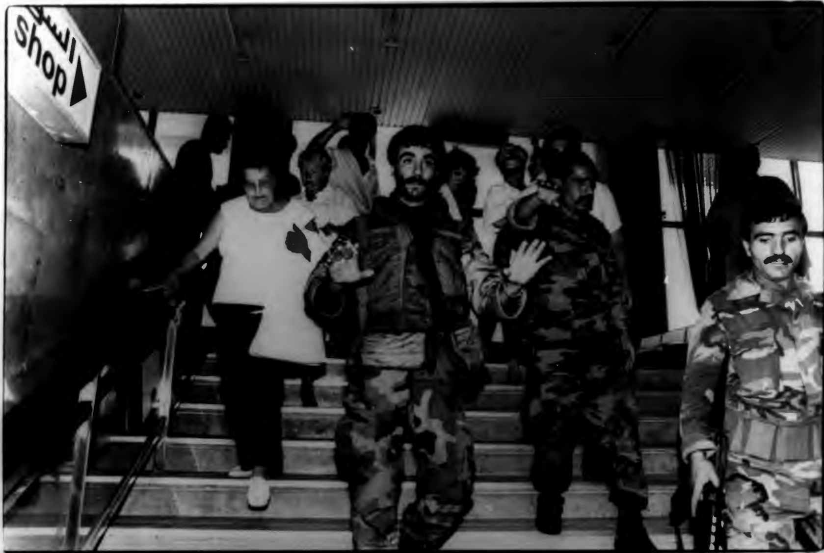
(BEI-7) BEIRUT, LEBANON, JUE. 14 (AP)—ESCORTING PASSENGERS RELEASED—Lebanese Army soldiers carrying their automatic rifles escort released woman and children passengers at Beirut Airport Friday from the hijacked US Trans World Airlines plane. Gunmen took over the plane while on an Athens-Rome flight, diverted it to Beirut for refueling and then took off to Algeria with 124 passengers after releasing 19 of the passengers. 1985