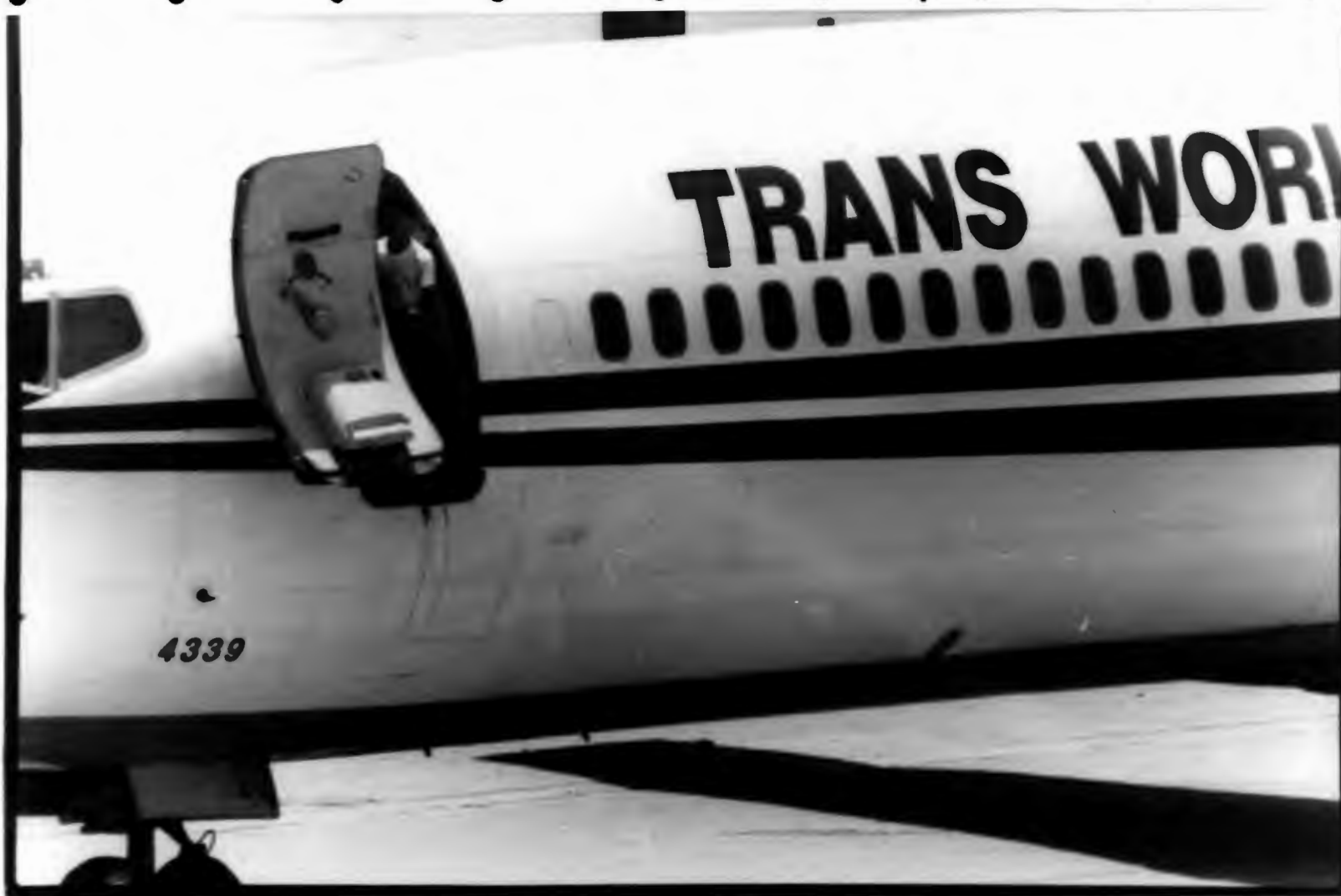
(BEI-6) BEIRUT, LEBANON, JUNE. 19—HIJACKERS AT THE PLANE DOOR—A Shiite Moslem hijacker armed with a Soviet-made AK-47 rifle looks out of the door of the hijacked American Trans world airlines jet Wednesday, held at Beirut International Airport since last Sunday. The hijacker wore a white T-shirt with the drawing of the star of David and fist in the middle as a sign of the Shiite struggle against Israel. The plane was hijacked on an Athens-Rome flight last Friday and the sky pirates demanded the release of 700 Shiite Moslem jailed in Israel. 1985