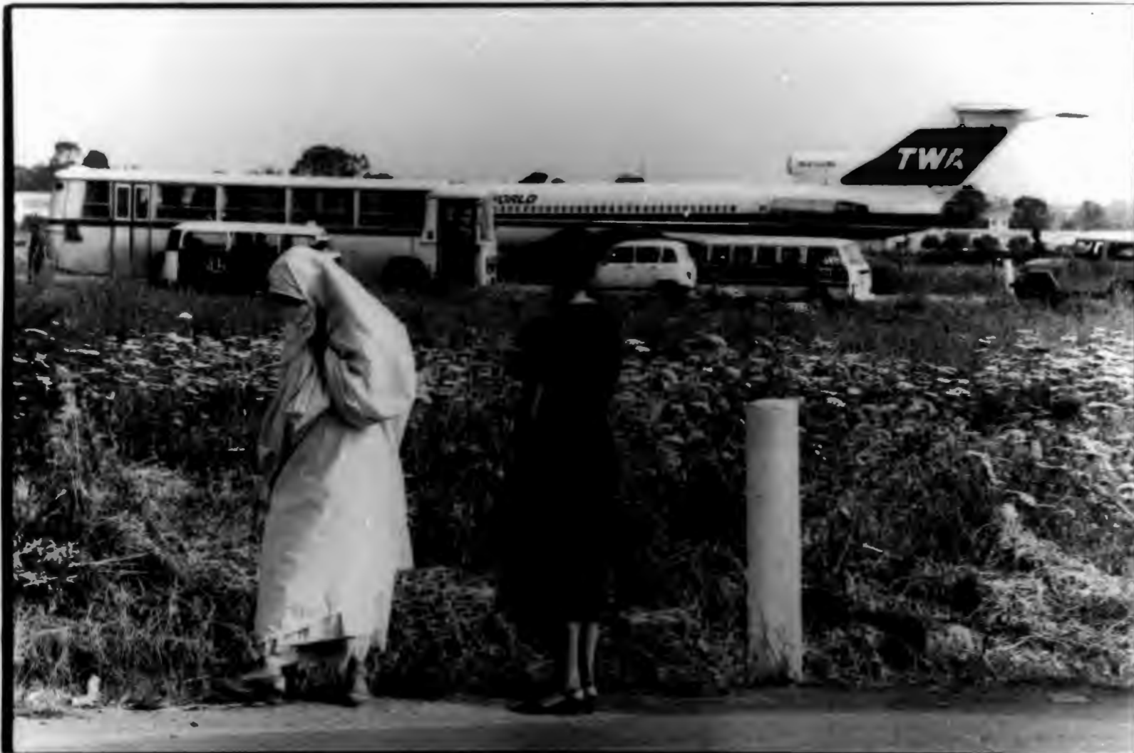
(PAR-3) ALGIERS, ALGERIA, June 15th-(AP)-HIJACKED--Two women stand near the limits of the Algiers Houari Boumedienne airport Saturday with visible on the background the hijacked Trans World Airline Boeing 727. With still 98 passengers aboard, eight crew members and the two hijackers plus two other hijackers who boarded in Beirut, the plane is currently still in Algiers. This plane was hijacked Friday during a regular flight between Athens and Rome with 145 passengers. 44 passengers were freed during the stopovers in Beirut and Algiers and one was killed in the Lebanese airport. 1985