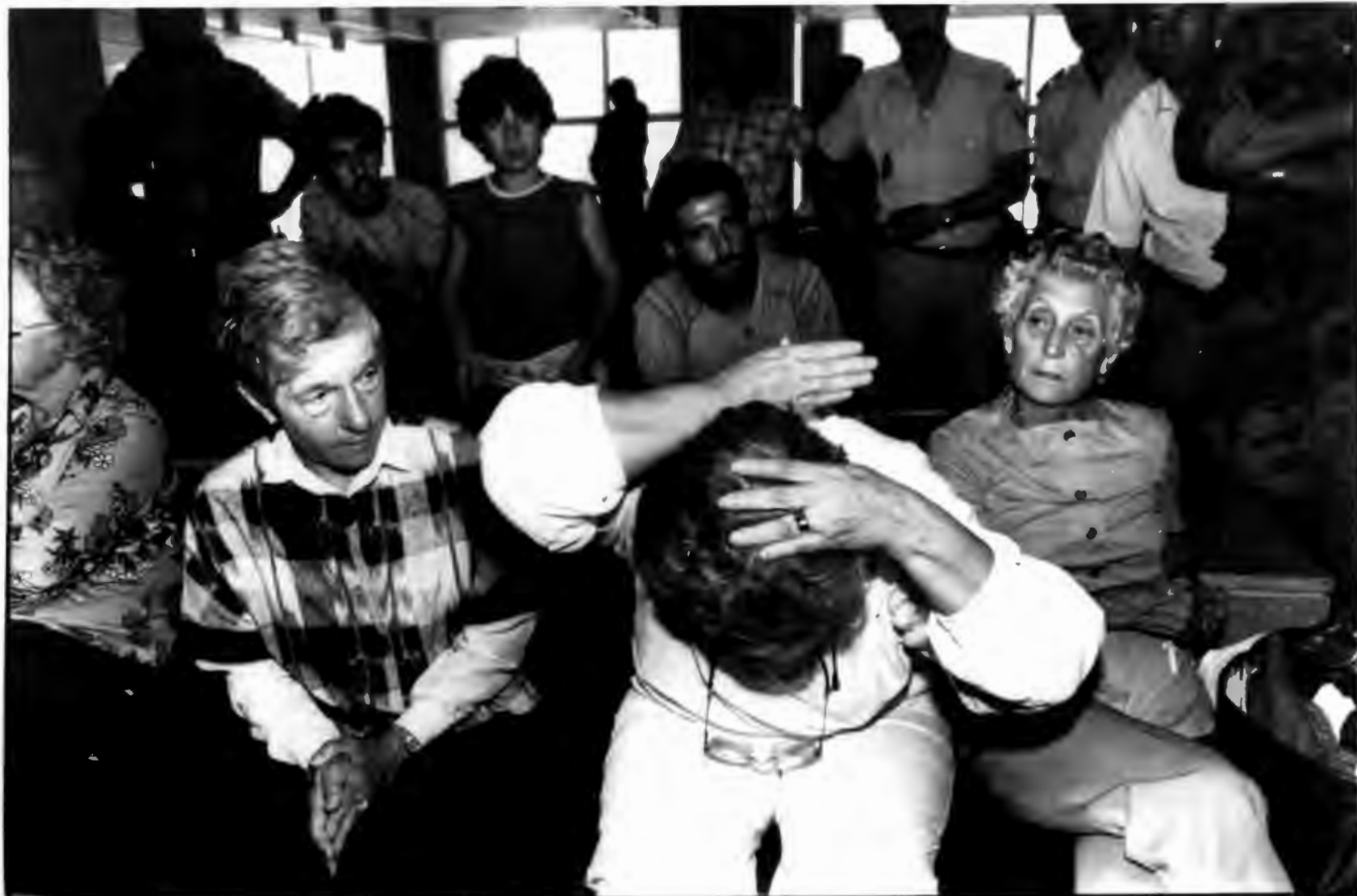
(BEI-8) BEIRUT, LEBANON, JUNE. 14 (AP)—HIJACKERS BEAT US—AN elderly American woman sitting between two others explains to reporters upon their release at Beirut airport Friday how the hijackers beat up the passengers on their necks. The three were among 19 passengers released in Beirut before the hijacked US Trans World airlines plane refueled and took off with the remaining 124 passengers on board to Algeria. 1985