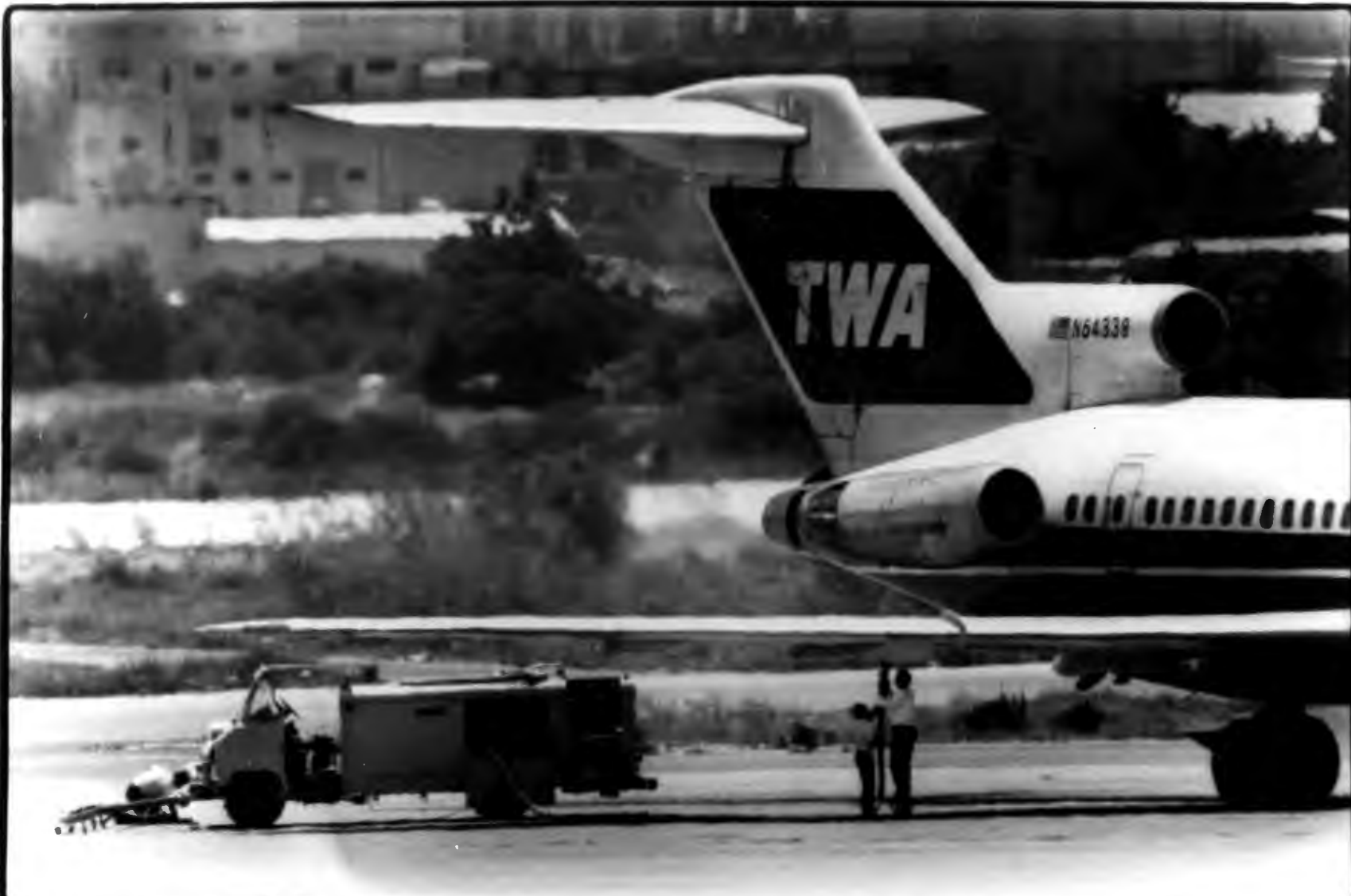
(BEI-2) BEIRUT, LEBANON, JUNE. 14 (AP)—HIJACKED PLANE FUELED—Two Lebanese gas workers refueling the hijacked US Trans World Airlines boeing 727 plane at Beirut International Airport Friday. The plane, hijacked on an Athens-Rome flight diverted to Beirut with 145 passengers and eight crew member. (AP WIREPHOTO) (Zs61120/Merliac/Stf 1985