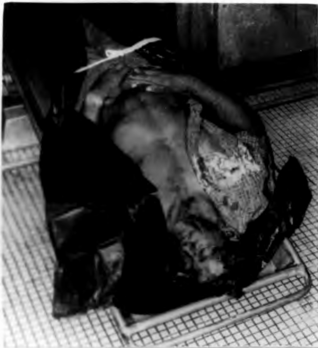
BEIRUT - In BEIRUT, LEBANON, JUNE 15 (AP)—AMERICAN KILLED—The Body of man identified by hospital official in Beirut as the victim of the hijackers US Trans World jetliner in the morgue of the American University hospital Saturday hours after he was shot in the left temple and tossed to the airport tarmac by the sky pirates. The red cross had volunteered to fly the body to the United States, but authorization has been denied by Shiite AMAL MILITARIANS. 1985