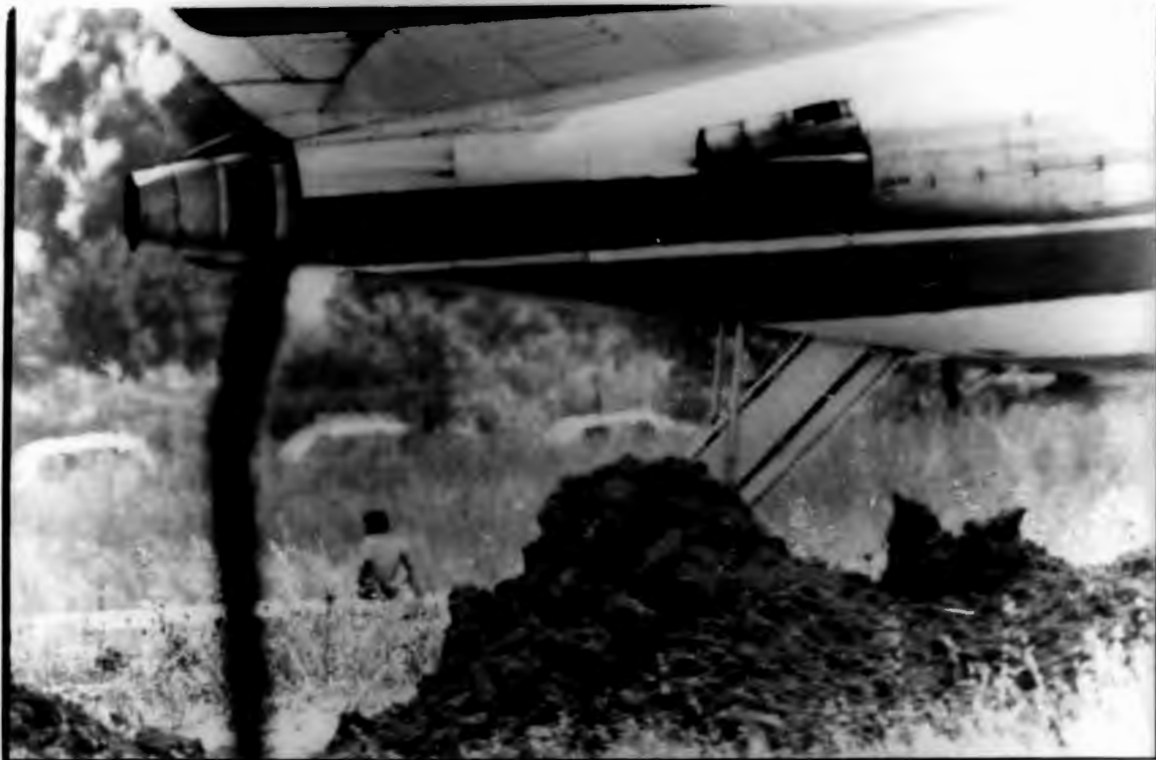
(PAR-8) ALGIERS, ALGERIA, June 15th-(AP)-TAKING A BREAK-Two hijackers enjoy a few minutes of fresh air on the ground next to the rear stairway of the Trans World Airline Boeing 727 jetliner on a runway of the Algiers Houari Boumediene airport Saturday. The TWA jetliner was hijacked Friday during a regular Athens Rome flight with 145 passengers aboard, most of whom were later released in Beirut and Algiers. (ad72217) 1985