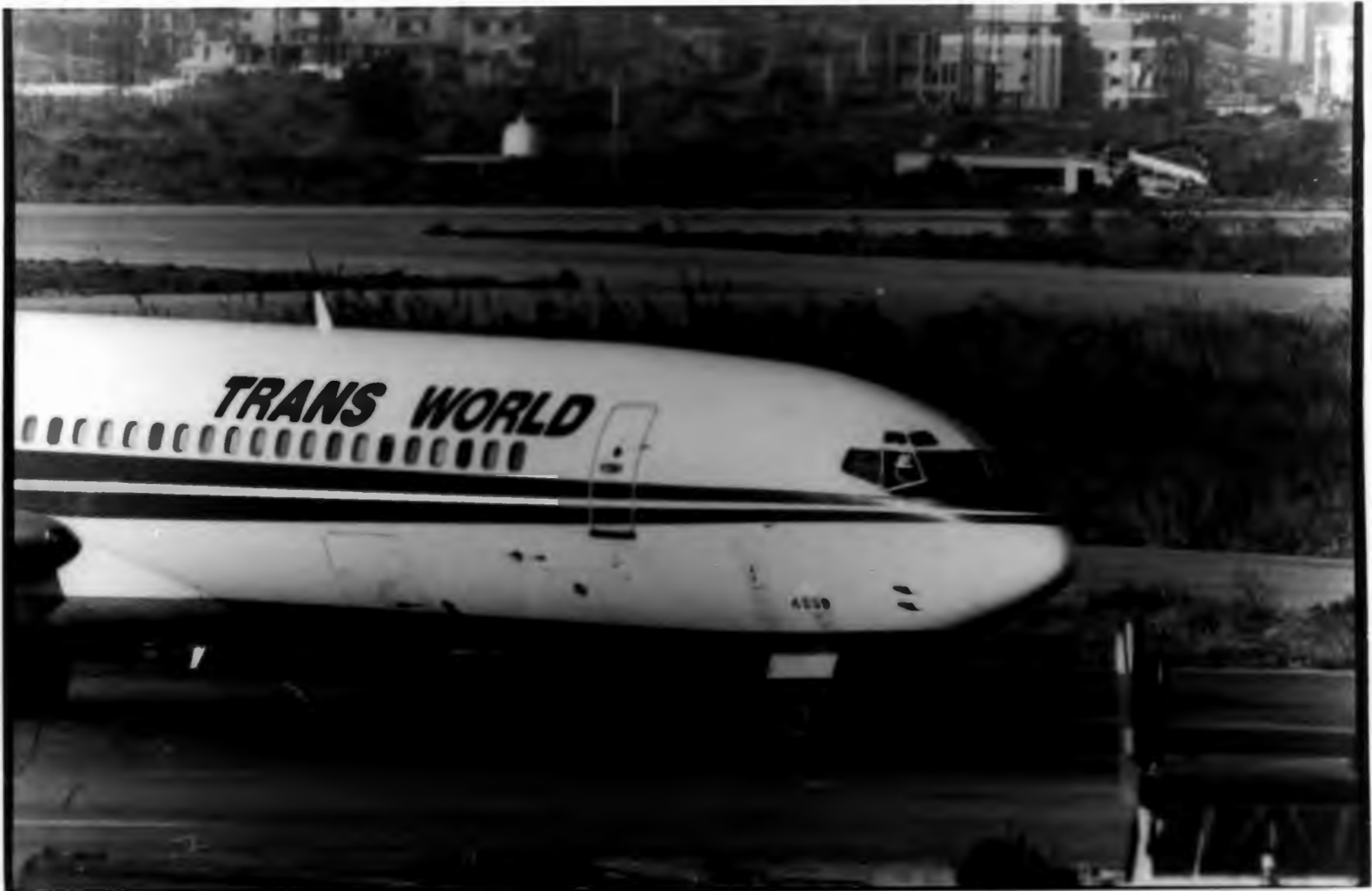
(BEI-1) BEIRUT, LEBANON , JUNE. 14 (AP)—HIJACKER PEERS OUT COCKPIT—A Shiite Moslem sky pirate peers out of a window in the cockpit of the hijacked trans world airlines Monday morning, shortly after the hijackers established their first contact with Beirut airport control tower, demanding that newspapers and sandwiches be sent to the aircraft. Some 40 hostages, mainly Americans, remain aboard the plane for a fourth day as hijackers demand therelease of 800 Lebanese prisoners in Israel.