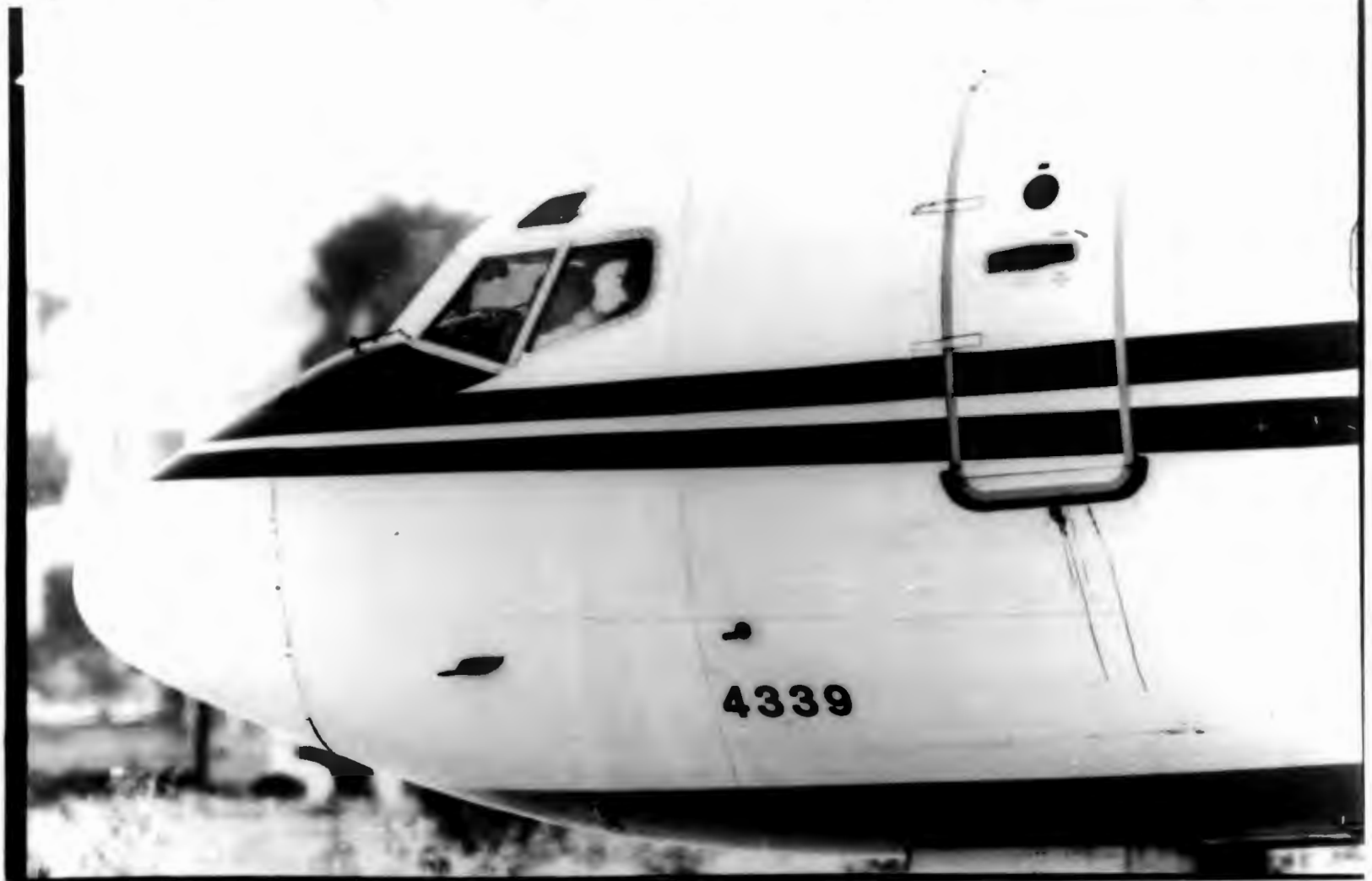
(PAR-4) ALGIERS, ALGERIA, JUNE 15 - (AP)-BLOOD-Close view of the nose of the Trans World Airline Boeing 727 which was hijacked Friday during a regular Athens-Rome flight with 145 passengers aboard, here on a runway of the Algiers Houari Boumediene airport Saturday morning. Visible on the left, the pilot in the cockpit, and at right, traces of blood under the door, probably due to the killing of one of the passengers early Saturday during the second stopover of the plane in Beirut. 44 passengers were freed during the stopovers in Beirut and Algiers, and there still are 98 passengers aboard with the eight crew members and the four hijackers. 1985