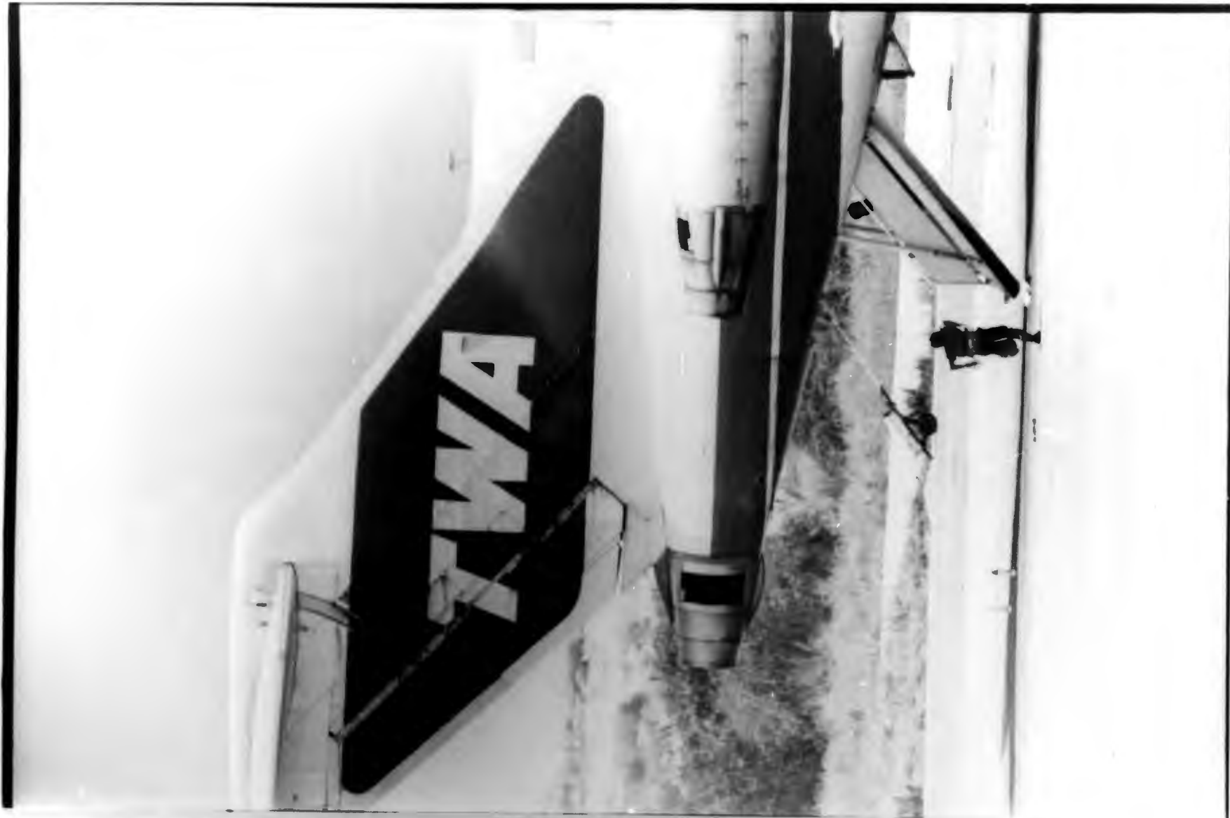
(BEI-2) BEIRUT, ELBANON, JUNE. 17 (AP)—RUNS TWOARDS THE TWA—An armed militiaman runs twoards the hijacked Trans World Airlines jet Monday carrying newspapers to the hijackers on board of the beoing 727 tagied at Beirut International Airport with some 40 mainly American hostages. The hijackers are demanding the release of 800 Shiite Moslem from Israeli Jails (AP WIREPHOTO) (as21221Gmt/Azakir/Str) 1985