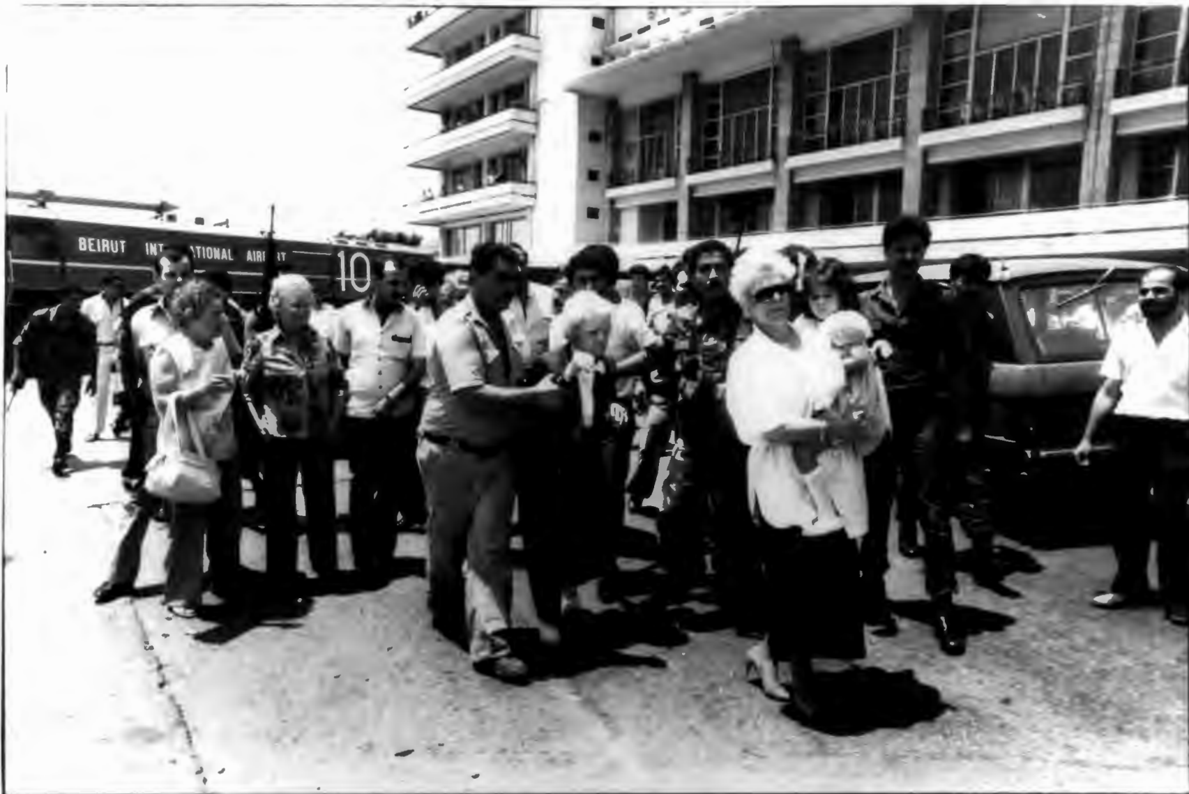
(BEI-3) BEIRUT, LEBANON, JUNE. 14 (AP)—RELEASED PASSENGERS—Elderly American Tourist passengers released from the hijacked US Trans World Airlines, escorted by Lebanese Airport security Friday at Beirut International airport. The plane, hijacked on an Athens-Rome flight diverted to Beirut with 145 passengers and eight crew member onboard, refueled and took off to Algeria. (AP WIREPHOTO) (zs61215Gmt/Saiddi/Str) 1985