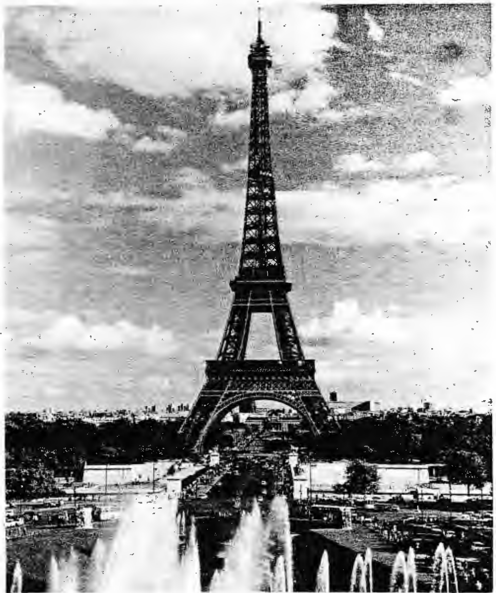
Alexandre Gustave Eiffel designed the 295-meter-high iron tower for the Paris exposition of 1889.

Economy and Finance—Jacques Delors Budget—Henri Emmanuelli (State Secretary) Consumer Affairs—Catherine Lalumiere (State Secretary) Social Affairs—Pierre Beregovoy Employment—Jack Ralite (Junior Minister) Health—Edmond Herve (State Secretary) Family Affairs, Immigrants— Georgina Dufoix (State Secretary) Senior Citizens—Daniel Benoist (State Secretary) Repatriated Citizens—Raymond Courriere (State Secretary) Interior and Decentralization—Gaston Defferre Public Security—Joseph Franceschi (State Secretary) Overseas Departments and Territories—George Lemoine (State Secretary) Transportation—Charles Fiterman Maritime Affairs—Guy Lengagne (State Secretary) Justice—Robert Badinter External Affairs—Claude Cheysson Development and Cooperation— Christian Nucci (Junior Minister) Defense—Charles Hernu Defense—Jean Gatel (State Secretary) Veterans' Affairs—Jean Laurain (State Secretary)