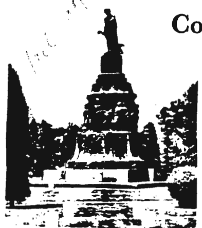
Confederate Monument, Jackson Circle Arlington National Cemetery