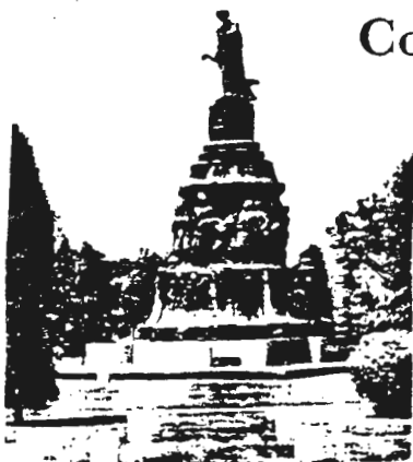
Confederate Monument, Jackson Circle Arlington National Cemetery