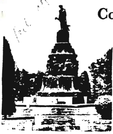
Confederate Monument, Jackson Circle Arlington National Cemetery