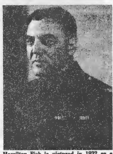
Hamilton Fish is pictured in 1932 as a colonel in the Army Reserves.