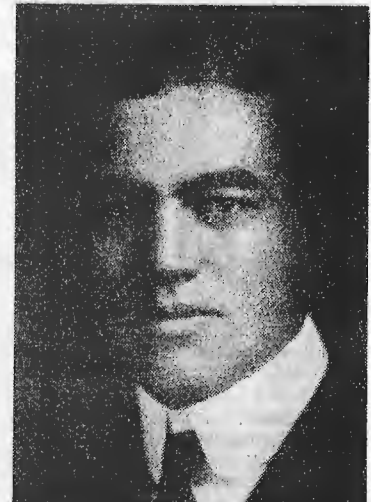
Hamilton Fish as Progressive or "Bull Moose" member of the New York state Assembly, 1914/16.

Cassette tapes of Hamilton Fish's speech at the 1979 annual meeting of Liberty Lobby's Board of Polky are available at $7.25 each from: Liberty Library, 300 Independence Ave., S.E., Washington, D.C. 20003.