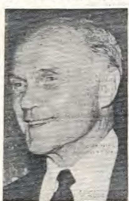
SEN. JOHN GLENN ... supported by independent voters