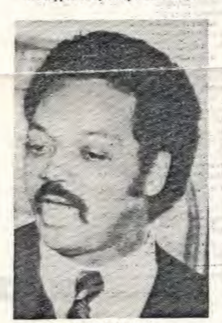
JESSE JACKSON ... leads the rest of the pack