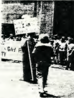
One of many examples of blatant blasphemy during 1982 "Gay Pride" parades.

PLEASE SEE ANNOUNCEMENT OF URGENT RADIO PROGRAM AT BOTTOM OF PAGE A Plea to our Fellow Americans of Christian Faith