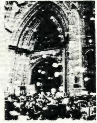
Militant "gays" take over steps of St. Patrick's Cathedral during 1982 "Gay Pride" parades.

To protect our families and our children, and to preserve our freedoms and our American Nation itself, people of all faiths must quickly cooperate and organize together based on our common values and above all on a firm