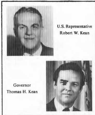
U.S. Representative Robert W. Kean