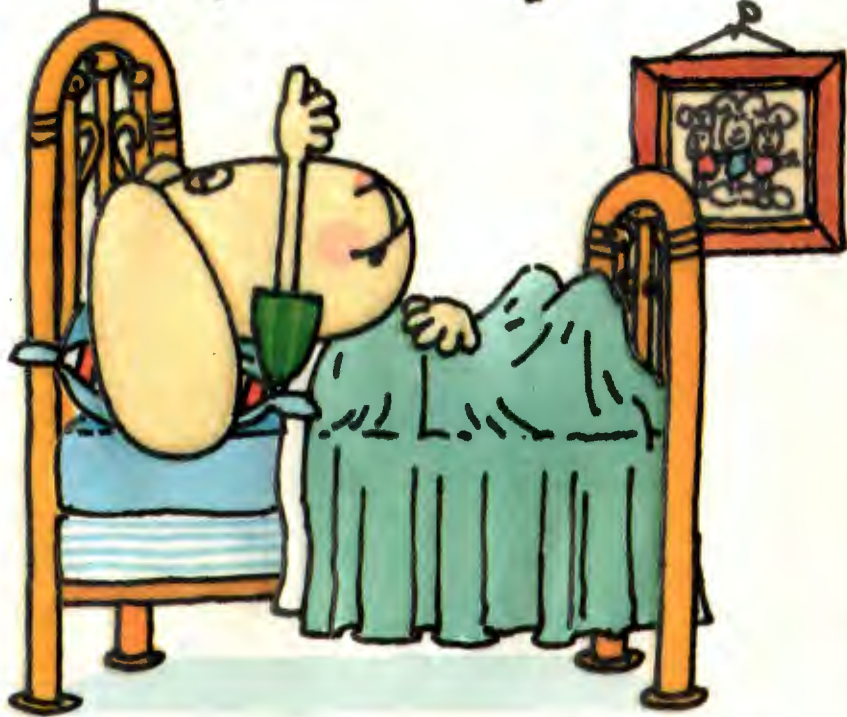
COUNTING CRACKS upon the ceiling;