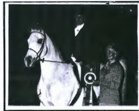
Astros Sadira ++ National Champion First Level Dressage