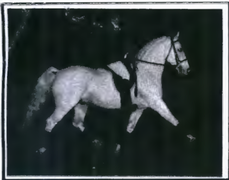
Lipizzan Stallion Pluto Bona II