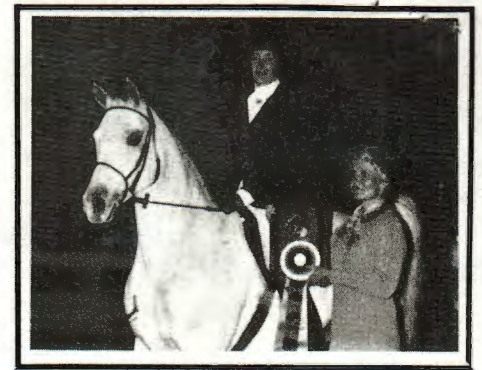
Astros Sadira ++ National Champion First Level Dressage

12145 LAKEROAD MONTROSE, MICH. 48457 (313) 639-2578