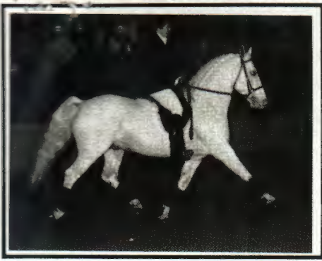
Lipizzan Stallion Pluto Bona II