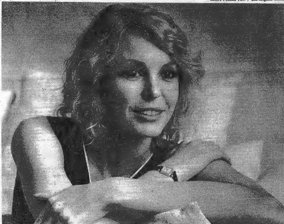
Victoria Tennant lands role opposite Robert Mitchum in the coming TV series "The Winds of War."