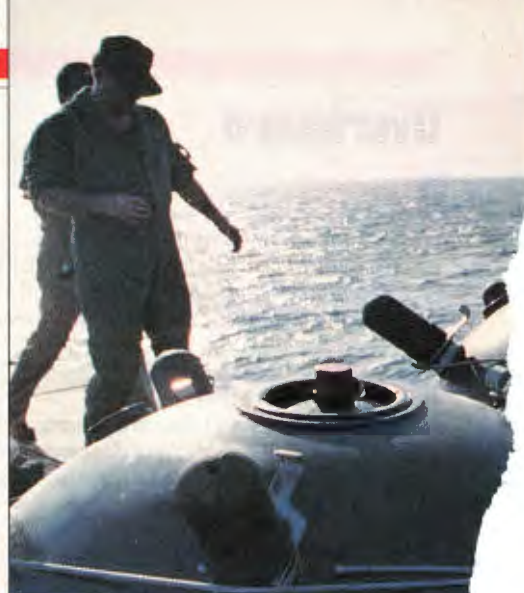
Red-handed: Mines aboard t.

Of course, the American ambush settled nothing. At the United Nations, Iran's president, a Muslim clergyman named Seyed Ali Khamenei, denounced the administration's minelaying evidence as "a pack of lies" concocted by "the Great Satan." Threatening retaliation, he warned