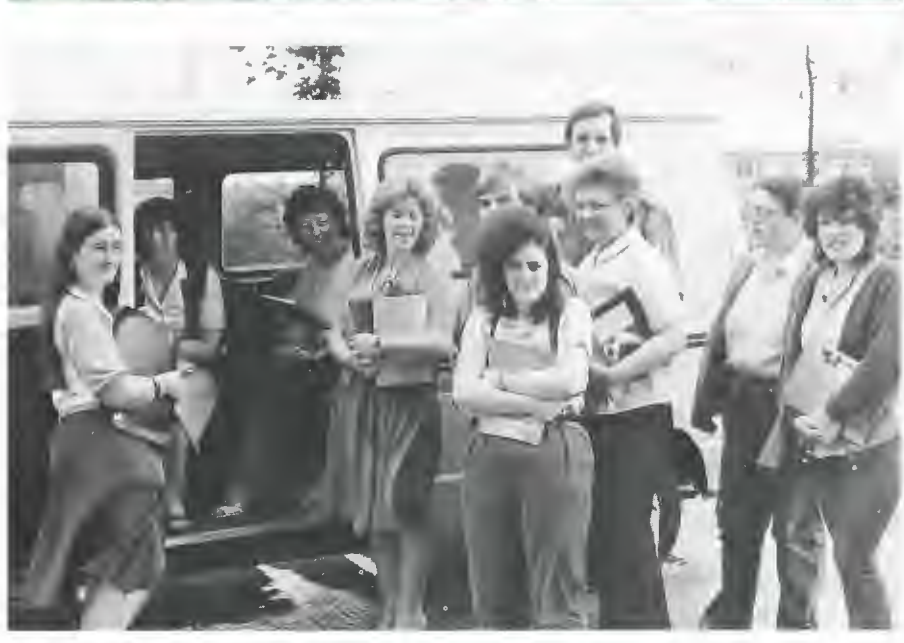
COMMUNITY EDUCATION: Members of the Northern Ireland Community Education Association prepare to attend a conference at Ulster University, Jordontown. The NICEA helps to develop awareness of community problems and assists the people to find the confidence and skills to deal with the problems on a community basis. An AIF grant supports their work.