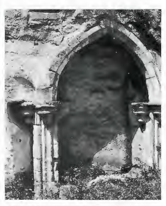
ABBEY RESTORATION: Duiske Abbey in Graignamanagh, Co. Kilkenny, was once a major monastic center in Ireland. This is the entrance to the Chapter House from the Cloister. Restoration is being aided by a $5,000 Foundation grant.