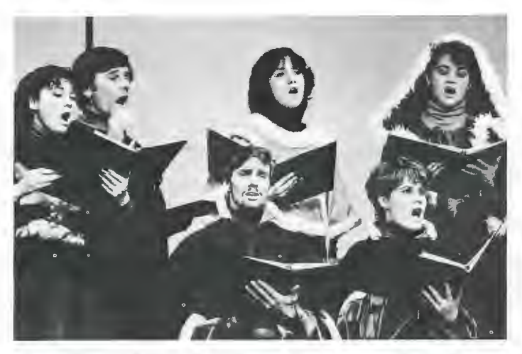
NEWPORT IRISH FESTIVAL: An excellent Irish Festival Concert was given by Salve Regina College in Newport, Rhode Island with Foundation assistance. The College Madrigal Singers are pictured at the performance on March 9th.