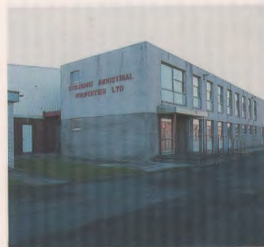
Strabane Industrial Properties Ltd: successful enough to require more workspace accommodation (right).

A budget of £500,000 has been made available to encourage experimentation and develop new community economic development initiatives.