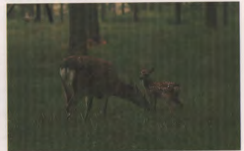
Sika deer — a farming diversification.

For particulars of the projects supported under this Programme, see Appendix 5.