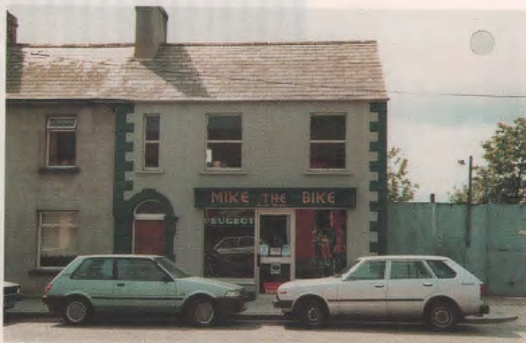
Improvements to cycling retail premises in Newtownards.

For particulars of projects supported under this Programme, see Appendix 4.