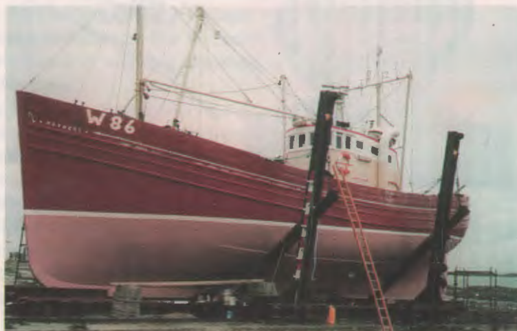
Fishing boat repair at Portavogie boatyard.

The aim of each company is to identify the risk capital needs for ventures of existing or new industrial and commercial enterprises and to provide, on sound commercial criteria, equity capital or loans. The normal practice of the investment companies will be to invest in ordinary or preference shares in private companies; they will be prepared to invest in greenfield or start-up operations but not in very high-risk or rescue projects.