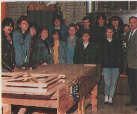
Light engineering skills training in a Londonderry youth project.