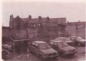
Modern bakery development at Sloan Street, Dungannon.

It is anticipated that, when all applications received up to March 1988 have been appraised, a total of over 250 projects throughout Northern Ireland will be assisted, with a total value of about £18m. A large proportion of these will be in disadvantaged areas.