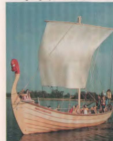
A Viking Longship in Fermanagh.