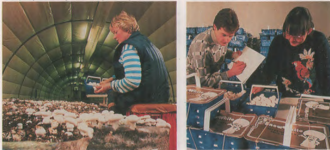
Mushroom production by South Armagh Farming Enterprises.

chains under the quality 'Snowcap' brand. It is estimated that this project will produce around 100 full-time jobs and 200 part-time jobs.