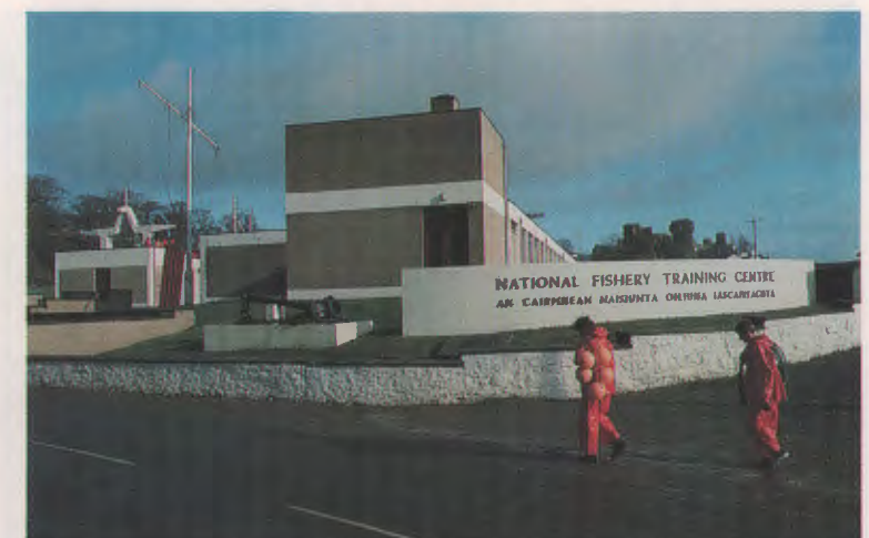
National Fishery Training Centre, Greencastle, Co. Donegal.

The scheme directly addresses the promotion of economic development in rural areas where job opportunities are limited. It will assist in maintaining existing jobs by raising the incomes of small farmers and thus help to counter rural depopulation.