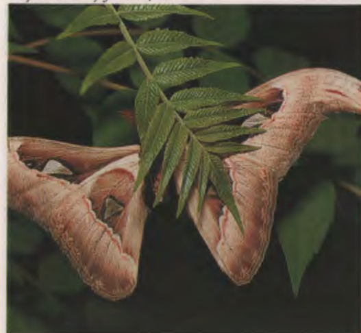
Seaforde Butterfly House, Co. Down.