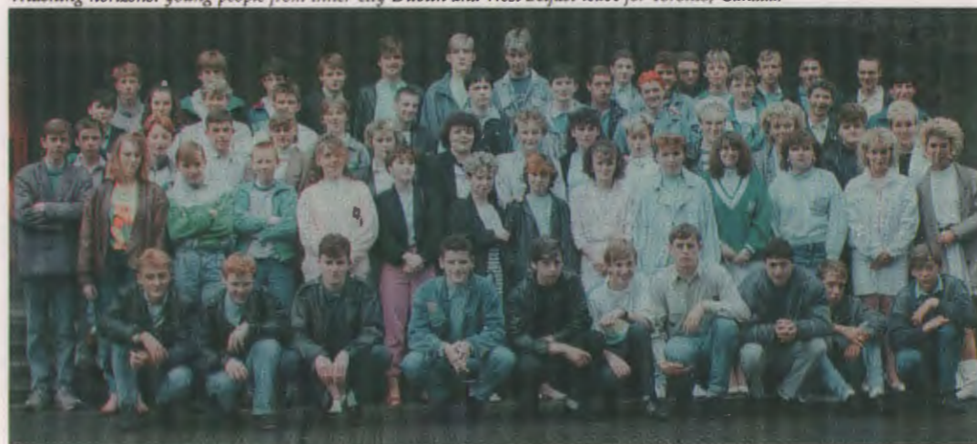
Widening horizons: young people from inner-city Dublin and West Belfast leave for Toronto, Canada.

A group drawn from five of these workshops in Derry, Limerick and Ennis, spent three months in the Danish Production Schools. A second group, from Belfast and Dublin, spent six weeks on work placement in Toronto,