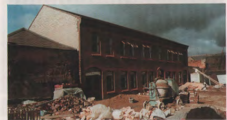
Market Street, Limavady: renovated and extended bakery premises.