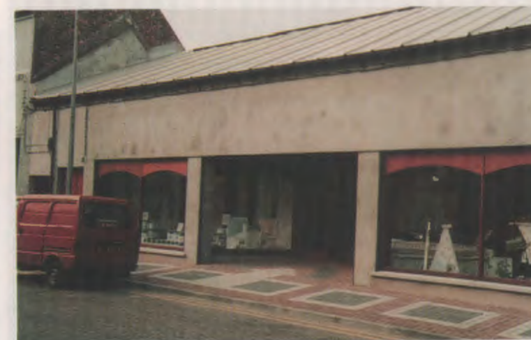
Rebuilt shopping facility at Point Street, Larne.