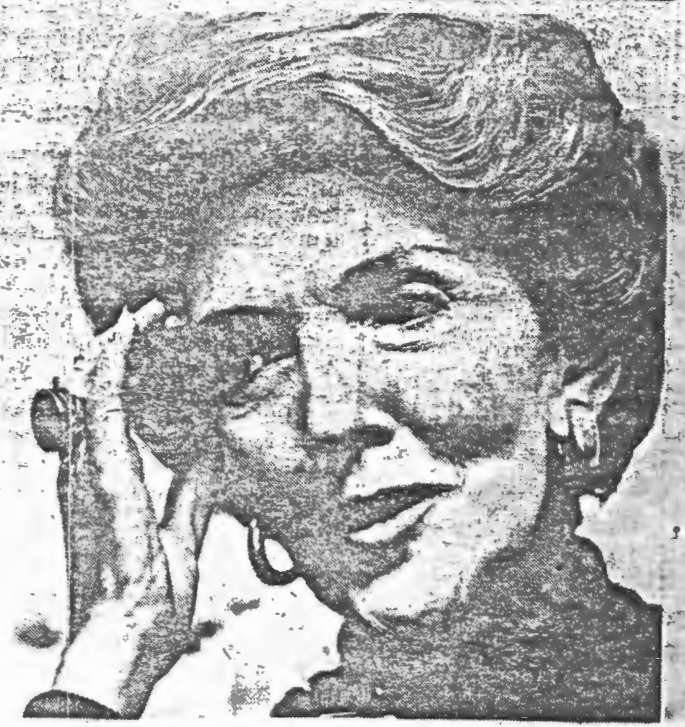
NANCY REAGAN: "Are we quite sure we're ready to play God?"

AS PRESIDENT Ronald Reagan tackles our economic and international problems, First Lady Nancy lashes out at the moral crisis that threatens to cripple America.