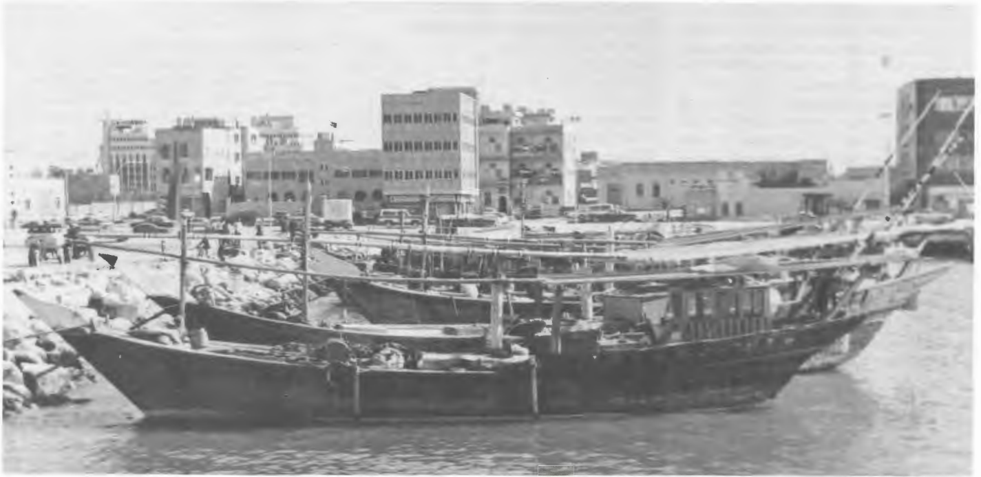
Fishing dhows still dock along Kuwait's shores. Their use, however, is rapidly dying out.

Oil Company, which produces oil and gas; Kuwait National Petroleum Co., refining and domestic sales; Petrochemical Industries Co., producing ammonia and urea; Kuwait Foreign Petroleum Exploration Co., with several concessions in developing countries; Kuwait Oil Tanker Co.; and Santa Fe International Corp. The latter, purchased outright in 1982, gives KPC a worldwide presence in the petroleum industry.