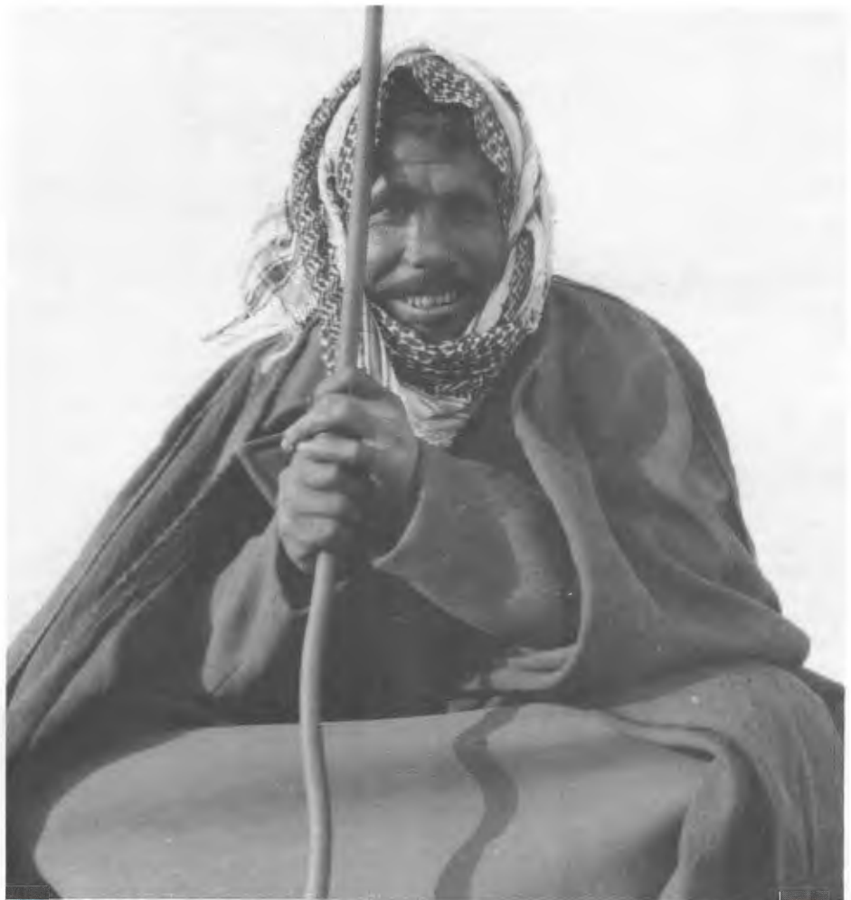
Before the advent of tremendous oil revenues, most Kuwaitis relied on traditional livelihoods such as nomadic herding. Such occupations are now followed by a very small and dwindling segment of the population.

This wealth is largely based on Kuwait's dominant exports of oil and capital. Oil accounts for about 85% of merchandise exports and for the same percentage of government revenues. Income from foreign investments make up most of the balance of public revenues. This wealth is based on the increase in oil prices during the 1970s which Kuwait, through its membership in the