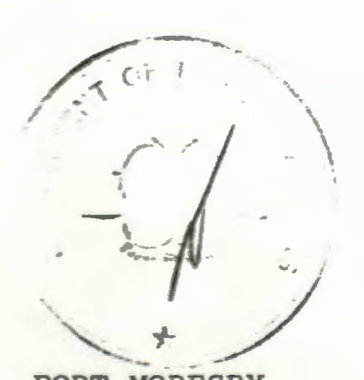
PORT MORESBY 11TH MAY, 1987

The Department of Foreign Affairs avails itself of this opportunity to renew to the Embassy of the United States of America, the assurances of its highest consideration.