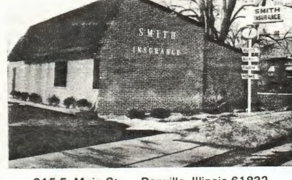
915 E. Main St. - Danville, Illinois 61832