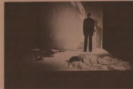
Americans: Robert Wilson's "Deafman Glimpse" at Toga-Mura