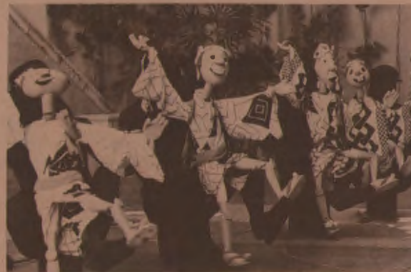
Japanese: PUK Puppet Theater in Hawaii