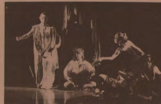
Japanese and Americans: "The Bacchae"- New York