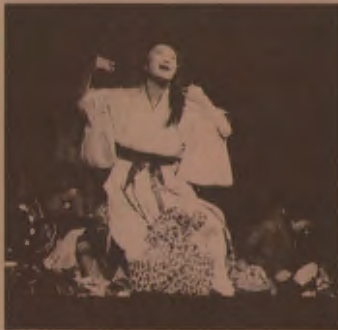
Japanese: "The Trojan Women" Chicago, St. Louis, New York