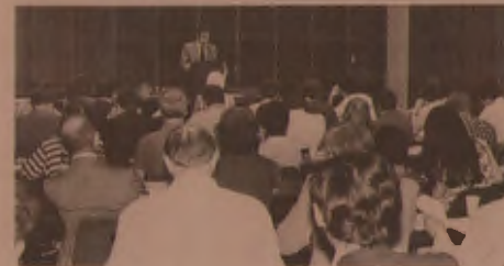
Japanese and Americans: A Japanese scholar speaks