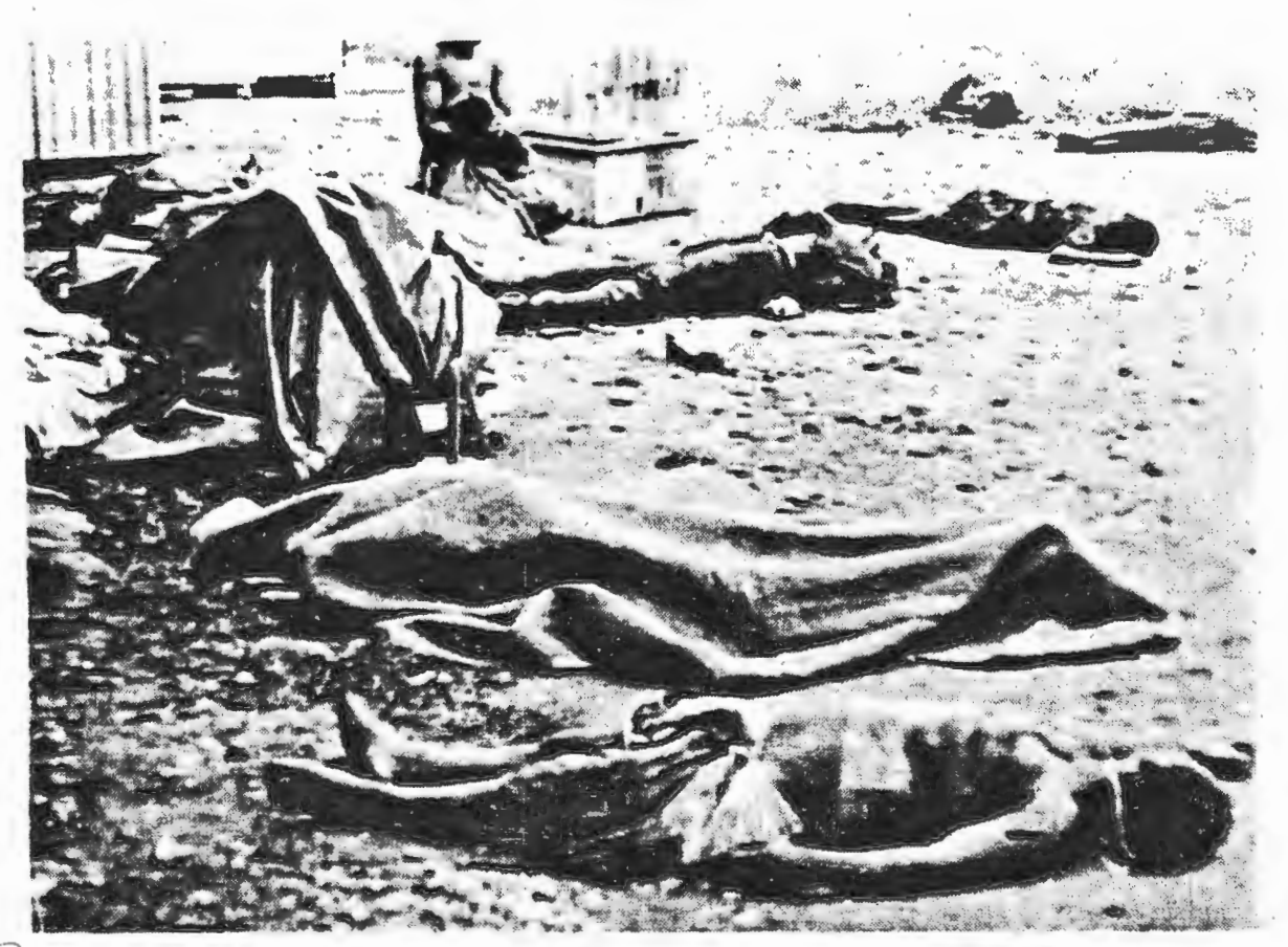
CAPTION 2: A number of dead bodies, all children, killed in the massacre of Ombaci. In the background, a tearful mother keeps vigil beside the slain children, 2 of whom were her own.