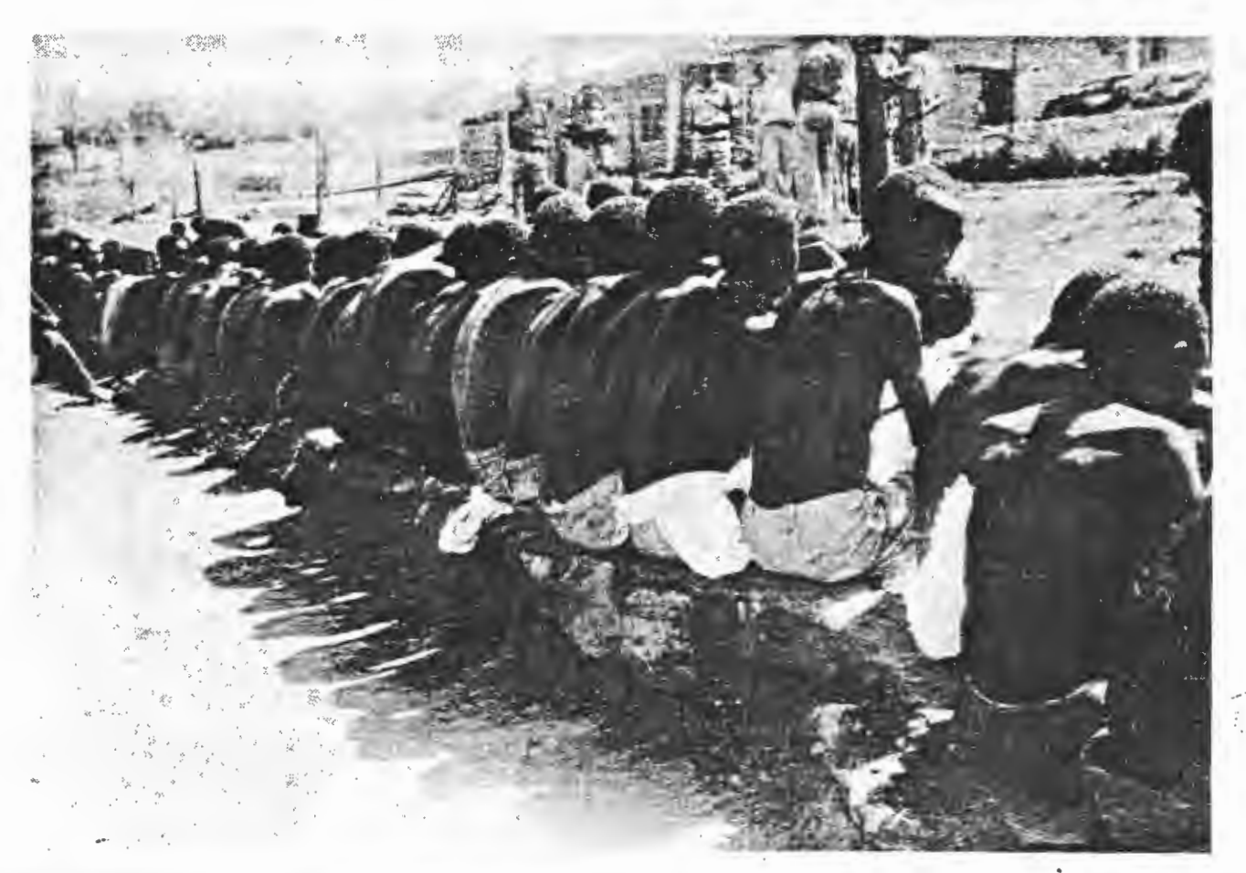
OBOTE'S PRISONERS — their bodies emaciated and shrunken by systematic starvation — sit under the surveillance of the dictator's callous "security" forces. No medical treatment, no legal counsel and no family access is allowed to prisoners in Military barracks such as Makindye, Kireka, Malire, Luzira etc.