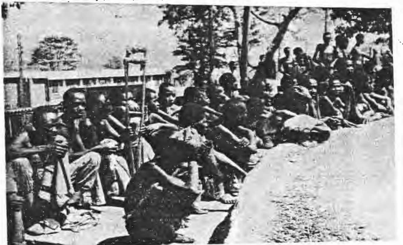
More emaciated and shrunken prisoners awaiting their death by starvation or by clubbing in Obote's jails and military barracks. They live in filth and utter squalor on bare concrete across the entire country, with neither water nor regular food.