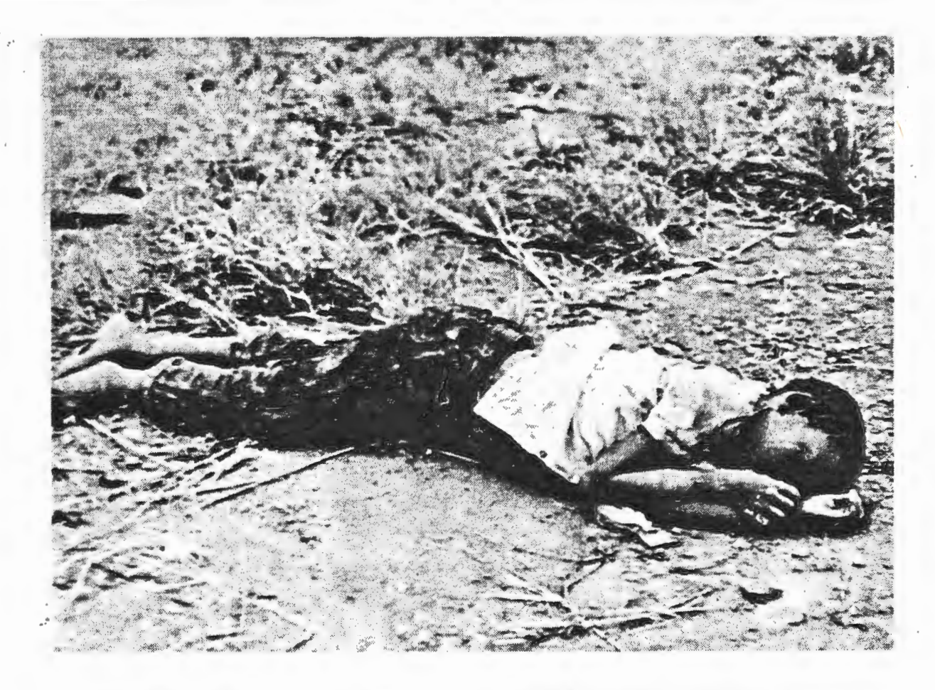
(2) CAPTION 3: This 9-year old boy was another victim of Obote's brutality in the massacre of Ombaci.